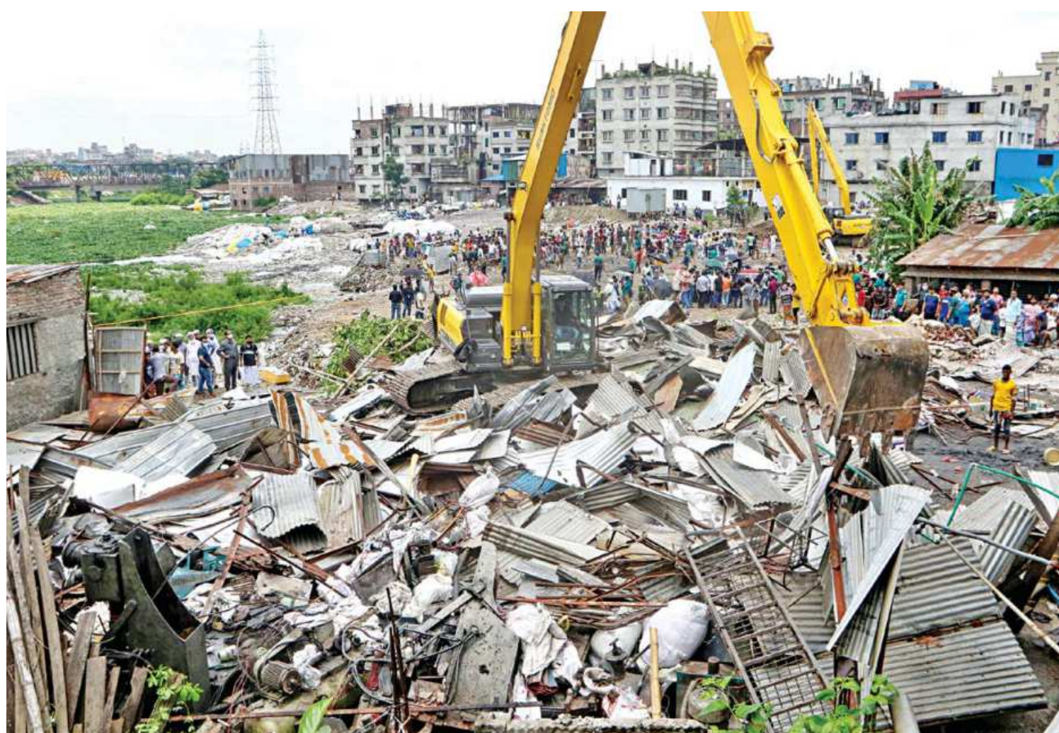
An excavator knocks down illegal structures along the Buriganga during an eviction drive by Bangladesh Inland Water Transport Authority (BIWTA) in Kamrangirchar's Battery Ghat area yesterday. The BIWTA carries out such drives periodically to free the river from encroachers.