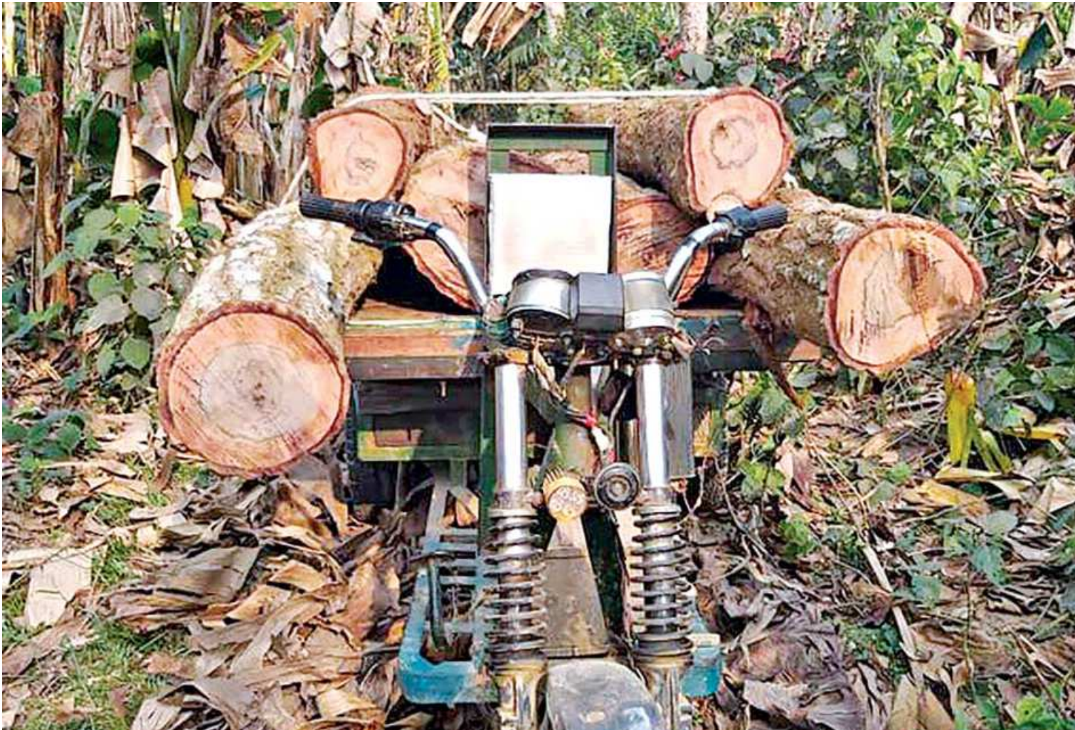
Logs of illegally felled trees are loaded on a three-wheeler in Modhupur Sal Forest. They were seized and taken to the forest department office in Tangail's Modhupur upazila. The forest area is depleting fast due to illegal logging and grabbing of forest land. The photo was taken recently.