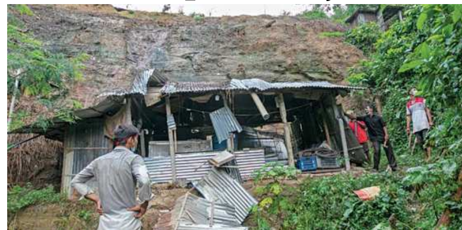
As authorities knocked down illegal, risky houses on hill slopes in Bayzid connecting road, residents said they were not given time to move their valuables.