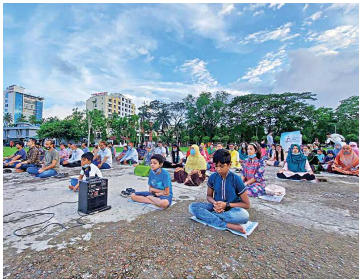
To encourage people to live a healthy, mindful life, especially during the pandemic, members of all ages of Quantum Foundation's Barishal unit participate in meditation sessions at the city's Bangabandhu Udyan under the open sky.