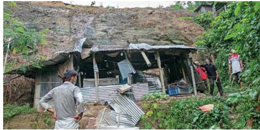
As authorities knocked down illegal, risky houses on hill slopes in Bayzid connecting road, residents said they were not given time to move their valuables.