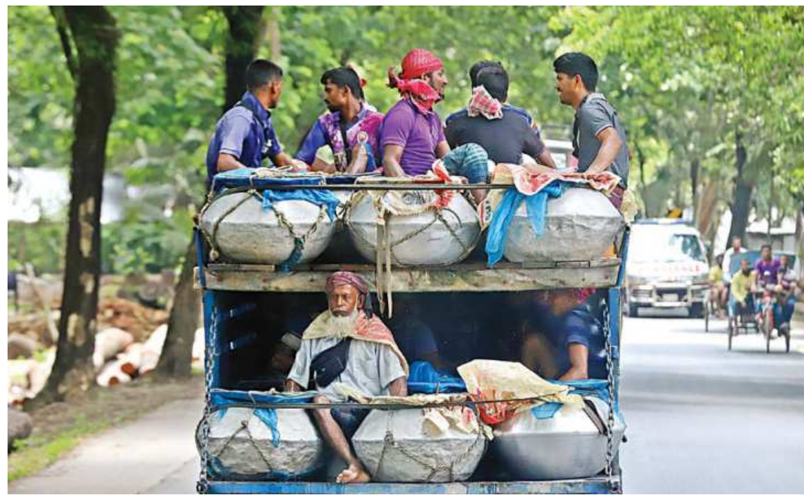
Traders taking fish fry in a vehicle to sell them to fish farms. Fish fry is usually released into water at the farms during this time of the year. The traders are constantly thumping the water in the pots to make sure the fry get enough oxygen. The photo was taken on Friday on the Khulna-Gopalganj highway.

Besides, BR sought time extension for other eight other projects: construction of dual gauge line parallel to the existing MG line on Dhaka-Narayanganj section; procurement of 200 MG passenger carriages; construction of Akhaura-Agartala rail link; procurement of 20 MG locomotives and 150 MG passenger carriages; rolling stock operations improvement project (rolling stock procurement); construction of rail line from Ishwardi to Rooppur Atomic Centre; construction of rail line between Chilahati and Chilahati Border; feasibility study and detail design for construction of a railway link to Sunamganj; and technical assistance for rolling stock operations improvement.