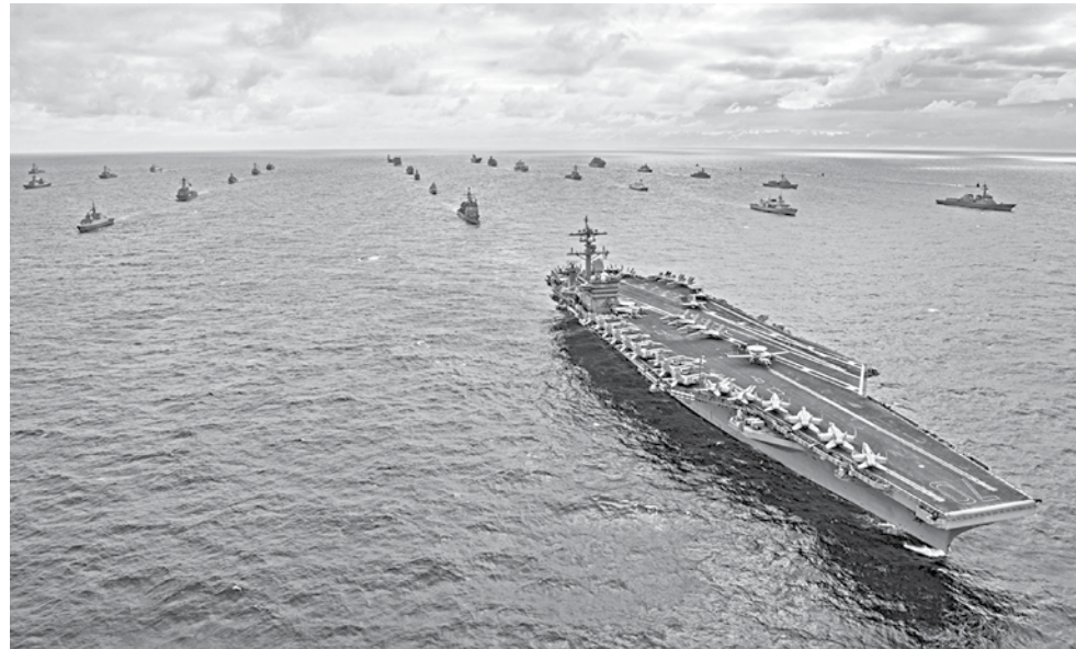
International Navy ships assemble off the coast of Hawaii during the Rim of Pacific Exercise (RIMPAC) on July 26, 2018.

The scope of operation of the Quad has not expanded to just include security. The "Quad Leader's Joint Statement" also displayed the four nation's commitment to tackling climate change. A more notable area of cooperation that the summit highlighted was equitable access for the Covid-19 vaccine in the Indo-Pacific. The Quad is not just confining themselves to conventional