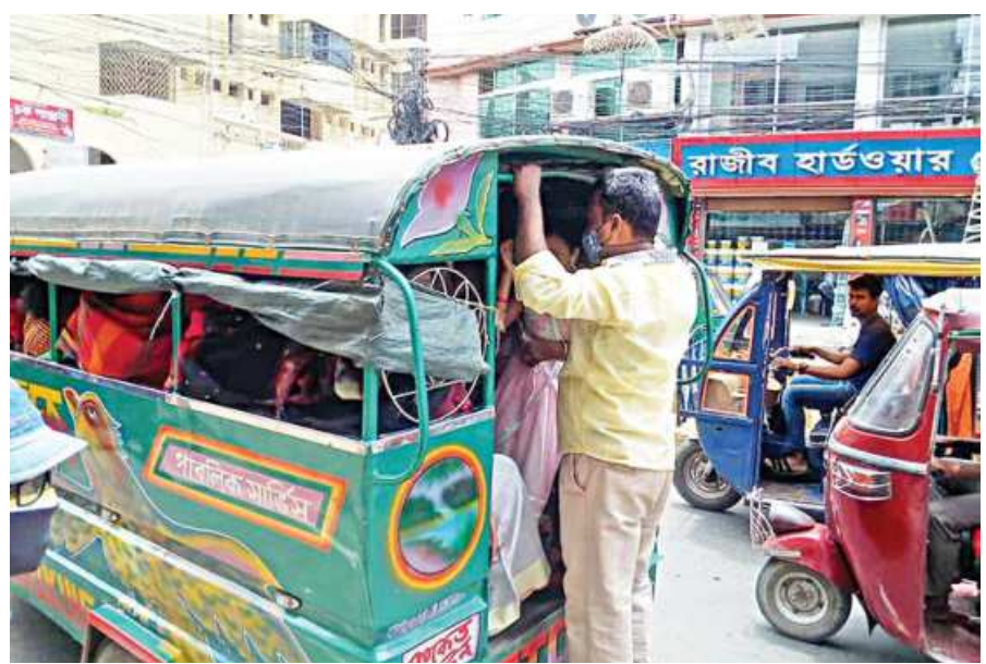
Public transports across the port city are overflowing with passengers, despite the government directive to carry no more than half capacity.