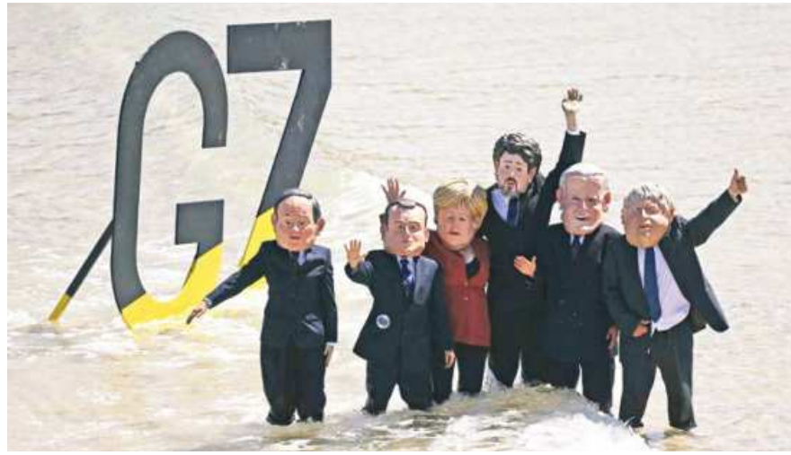
Extinction Rebellion environmental activists with masks of G7 leaders protest on the beach in St Ives, Cornwall during the G7 summit, yesterday.

"We remain seriously concerned about the situation in the East and South China Seas and strongly oppose any