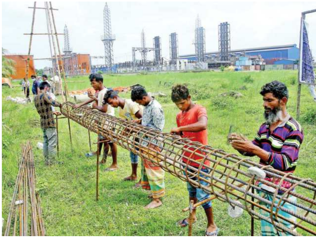
Workers set up boundary pillars on Buriganga river land right beside a power plant owned by late Dhaka-14 lawmaker Aslamul Hoque in Basila. The National River Conservation Commission in a report, as per a High Court directive, recommended its eviction and the pillars were supposed to be set up after recovering the grabbed river land. However, work seems to be going on in full swing while authorities of the power plant have not only fenced the area but also planted trees on the river land. Meanwhile, a signboard beside the river says the land is entitled to a bank. The photos were taken on Saturday.