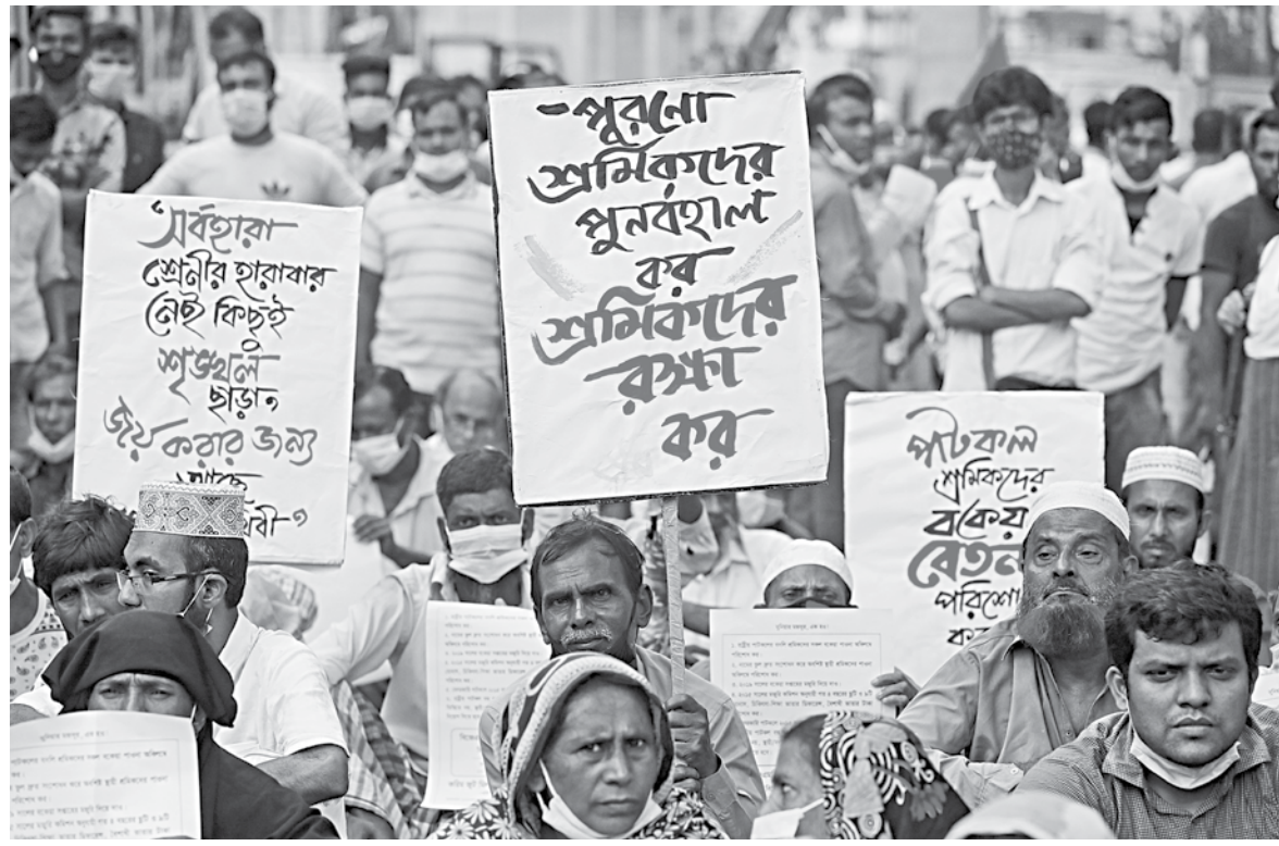
Sacked workers of Karim Jute Mill and Latif Bawani Jute Mill staged a demonstration in front of the Jatiya Press Club yesterday, demanding modernisation of the nationalised jute mills, reopening of these mills, re-employment of fired workers, and payment of transferred workers' dues.