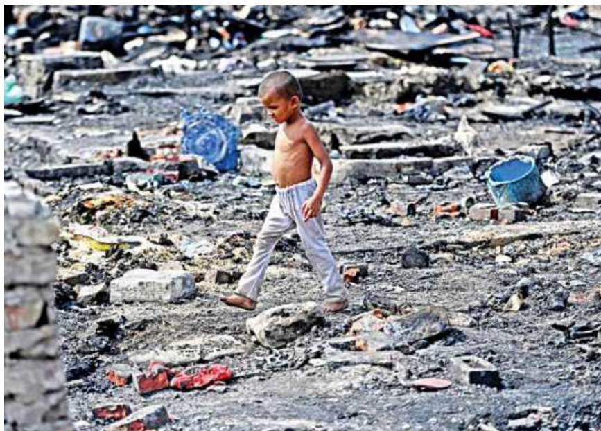
A young Rohingya refugee looks for his belongings amid the charred remains of his camp following a fire incident that broke out earlier yesterday in New Delhi, India. At least 57 shanties of Rohingyas staying for over two years, gutted in the fire that broke out at Kalindi Kunj area of southeast Delhi at midnight. No one was injured.

Britain has previously said Russia is a leading proponent of cyber attacks. The G7 statement called for wider action against ransomware attacks, describing the practice of encrypting victims' data and demanding payment for its return as an "escalating shared threat".