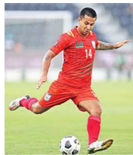
DS: How long do you want to represent Bangladesh, now that you are only 20?

TRK: Everything I learned over at Finland, in football as well as in life, I cherish fondly. But my key inspiration behind switching national teams was the pride of playing for my father's country which feels exceptionally meaningful.