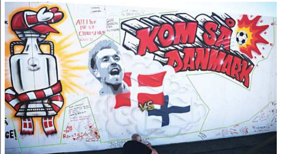
People write get well messages on a wall at a fanzone in Copenhagen after Denmark's Christian Eriksen collapsed on the pitch during his side's Euro 2020 match against Finland on Saturday.

"Our thoughts are with Christian Eriksen and his loved ones during these difficult times," Sparv tweeted. "Football is so insignificant when something like this happens. Life is precious. Take care of each other."