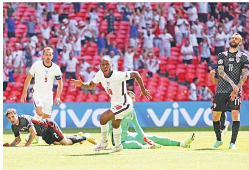
England's Raheem Sterling celebrates his all-important goal against Croatia in their Euro 2020 Group D opener in front of around 20,000 fans in the sun-drenched Wembley Stadium yesterday.

Roared on by a noisy 22,500 crowd -- a quarter of Wembley's capacity -- England started full of bright intentions and put huge pressure on the visitors, pinning them deep in their own half. Phil Foden, his bleached hair channelling Paul Gascoigne from Euro 96, almost gave them a dream start when he cut in from the right and