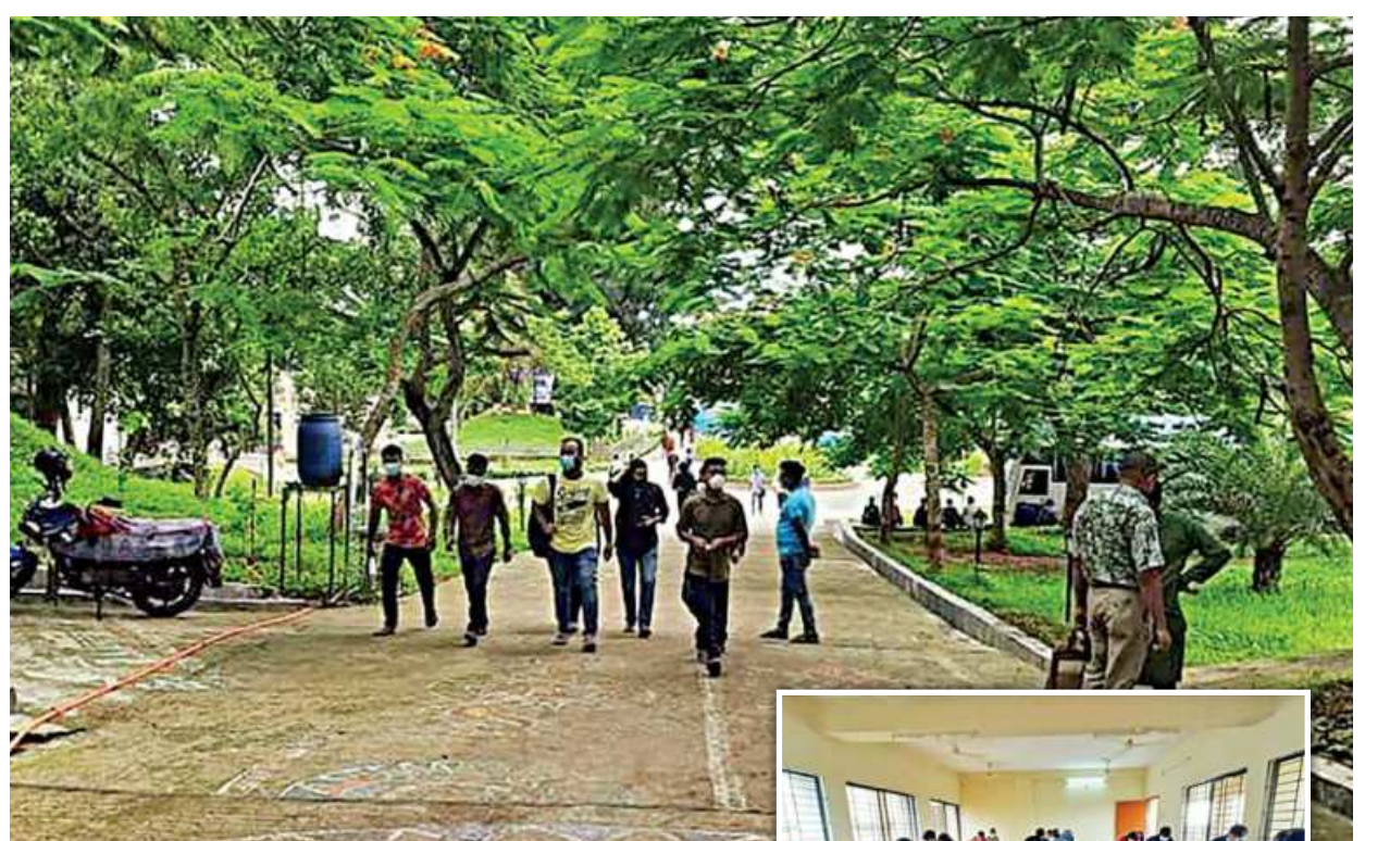
Students of Cumilla University returned to their campus yesterday after over a year, as the authorities began conducting in-person exams maintaining health safety guidelines.