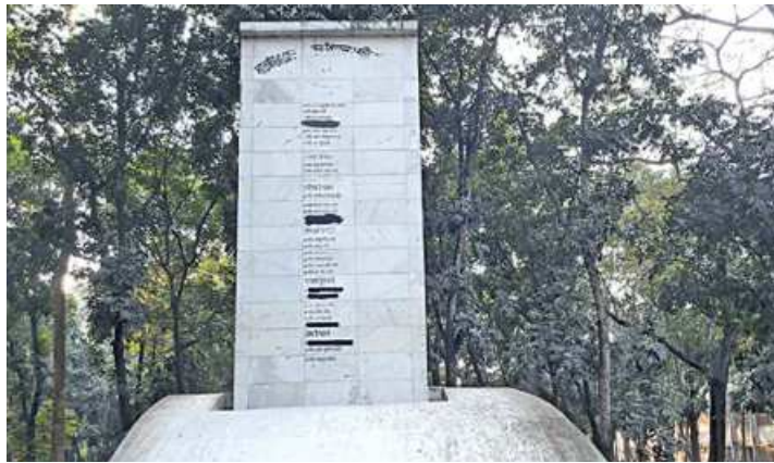
Memorial plaque on the premises of Satkhira deputy commissioner's office