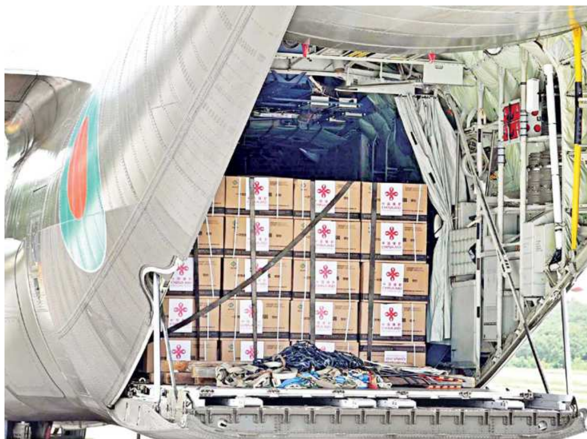
The shipment of six lakh Sinopharm Covid-19 vaccine doses arrives at the BAF Base Bangabandhu in the capital's Kurmitola yesterday from China.

[Our correspondents in Satkhira, Khulna, Bagerhat, Jhenidah, Kushtia Natore, Rajshahi and Chapainawabganj contributed to this report.]