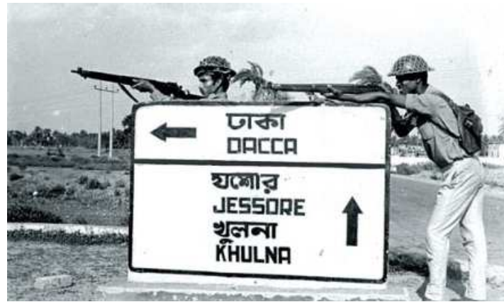
Bangladesh Mukti Foj at Jessore. April 4, 1971