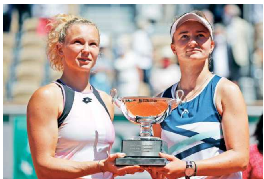
Barbora Krejickikova (R) became the first player to win both the women's singles and doubles title in Paris since Frenchwoman Mary Pierce completed the feat in 2000. Krejickikova and Katerina Siniakova beat Iga Swiatek and Bethanie Mattek-Sands 6-4, 6-2. The 25-year-old Krejickikova, who will climb to 15th in singles following her maiden Grand Slam singles title on Saturday, will return as the world number one doubles player when the rankings are updated today.

New Zealand will enjoy an extra day's rest before they take on India in the ICC World Test Championship Final starting in Southampton on Friday.