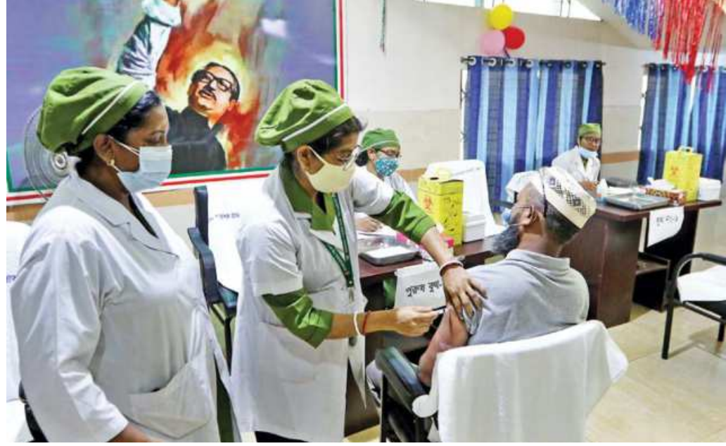
If Bangladesh lags behind in vaccination, the country's exports may face dire consequences, says a business leader.