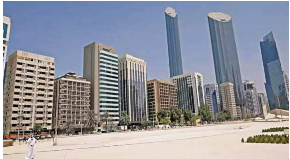
An Emirati man wears a protective mask as he walks past buildings in Abu Dhabi, the United Arab Emirates.

Economy Minister Abdulla bin Touq Al Marri said the changes were a bid to boost the "competitive edge" of the country, currently 16th in the World Bank's ease of