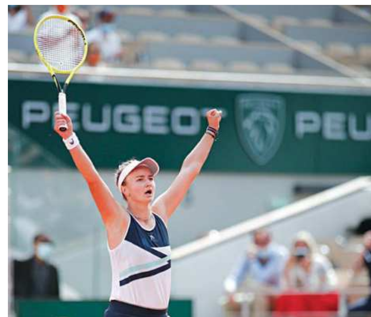
Czech Barbora Krejčíková claimed her maiden Grand Slam title after beating Russian Anastasia Pavlyuchenkova 6-1, 2-6, 6-4 in the French Open final on Saturday. The 25-year-old is the first Czech to lift the Suzanne Lenglen Cup since Hana Mandlíková, who represented Czechoslovakia, triumphed in 1981.

The series will commence on July 7 with the lone Test and the first of the three ODIs will be played on July 16 while the T20 series will begin on July 23. All the matches will be held in Harare, the capital of Zimbabwe.