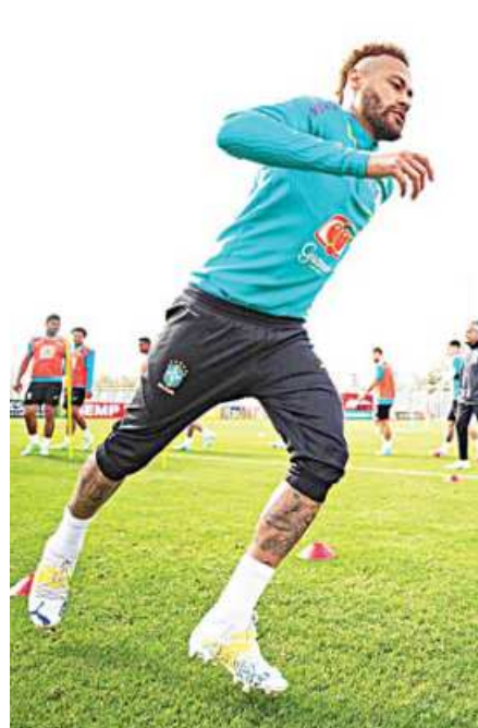
Neymar will spearhead the Brazil attack when the hosts take on Venezuela in the opening match of the Copa America on Sunday night while Argentina will look to Lionel Messi to end a 23-year title drought.

Shakib probably is the biggest beneficiary of the BCB's unprofessional attitude, with his latest act is just another example of Bangladesh cricket failing to act according to merit and just taking a nosedive.