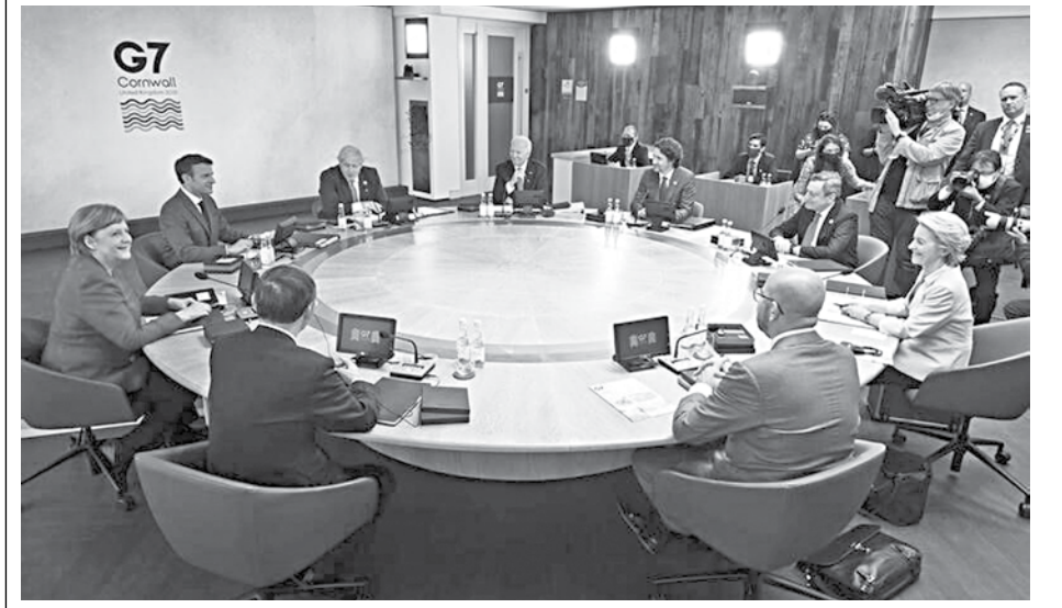
G7 leaders sit around a table at the top of the G7 meeting in Carbis Bay, Cornwall, Britain on June 11.