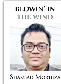
BLOWN' IN THE WIND

While we commend the government for allocating a sizeable sum for female owners of small businesses, it is disappointing to see this continuous disconnect between government policy action and the realities on the ground. We believe it is high time for the authorities to listen to the experts and accept their solutions on how to ensure the stimulus packages reach those who need it the most. One of the suggestions is that cash incentives, rather than loans, would be more effective in easing the burden of women with small businesses in the informal sector. Also, if medium-sized enterprises were exempted from paying VAT for at least three years, they would be able to sustain their industries for the next few years. Finally, concerned authorities have to carry out massive awareness raising campaigns across the nation to let small-scale businesswomen know how to avail government's funds, and banks, especially government-owned ones, must be more efficient in this process. At a time when the global pandemic has forced more than 41 percent of small businesses run by women entrepreneurs to close down (according to CPD), the government must do more to ensure these women do not fall into poverty despite their existing a safety net, simply because of difficulties in access.