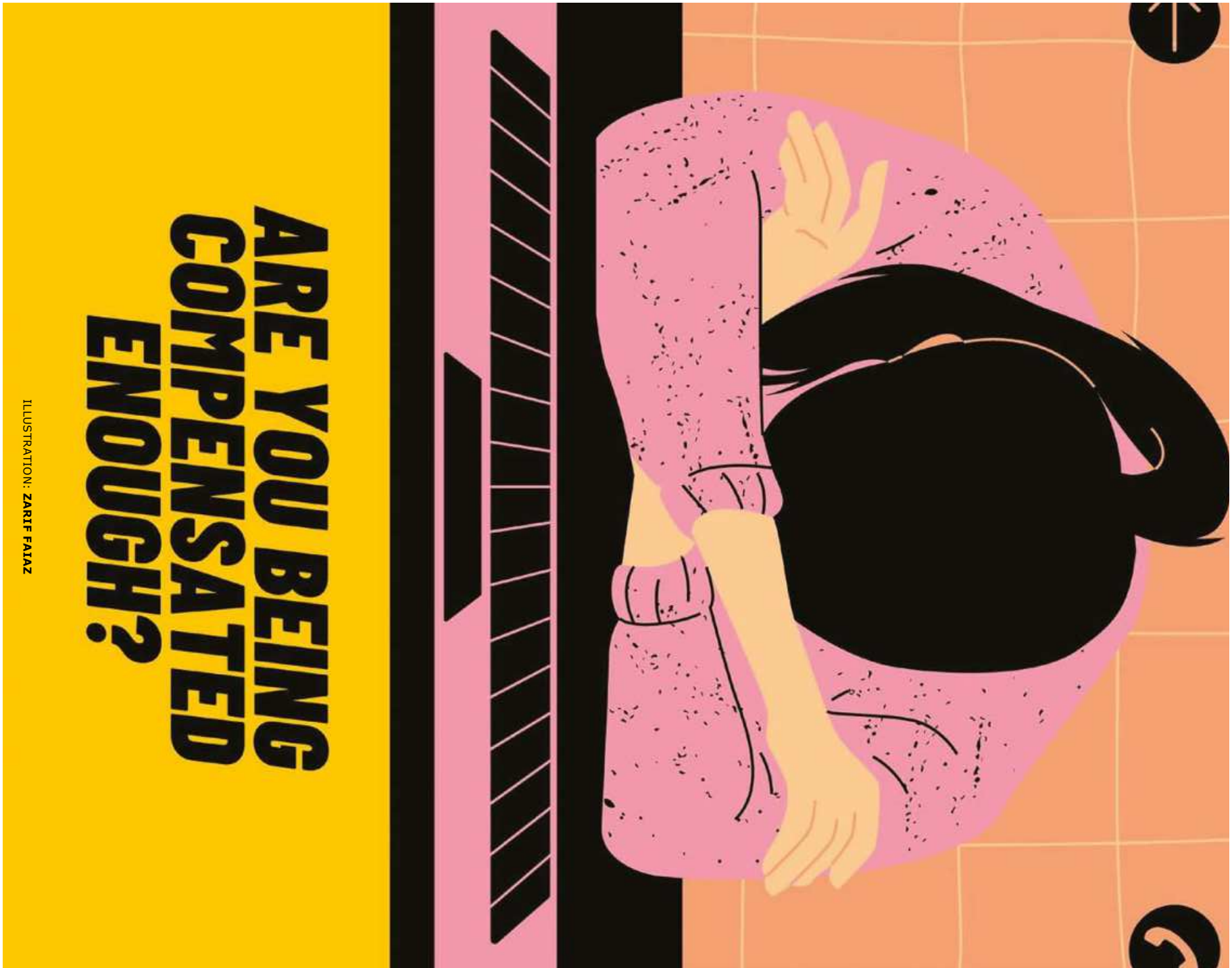
ILLUSTRATION: ZARIF FAIAZ