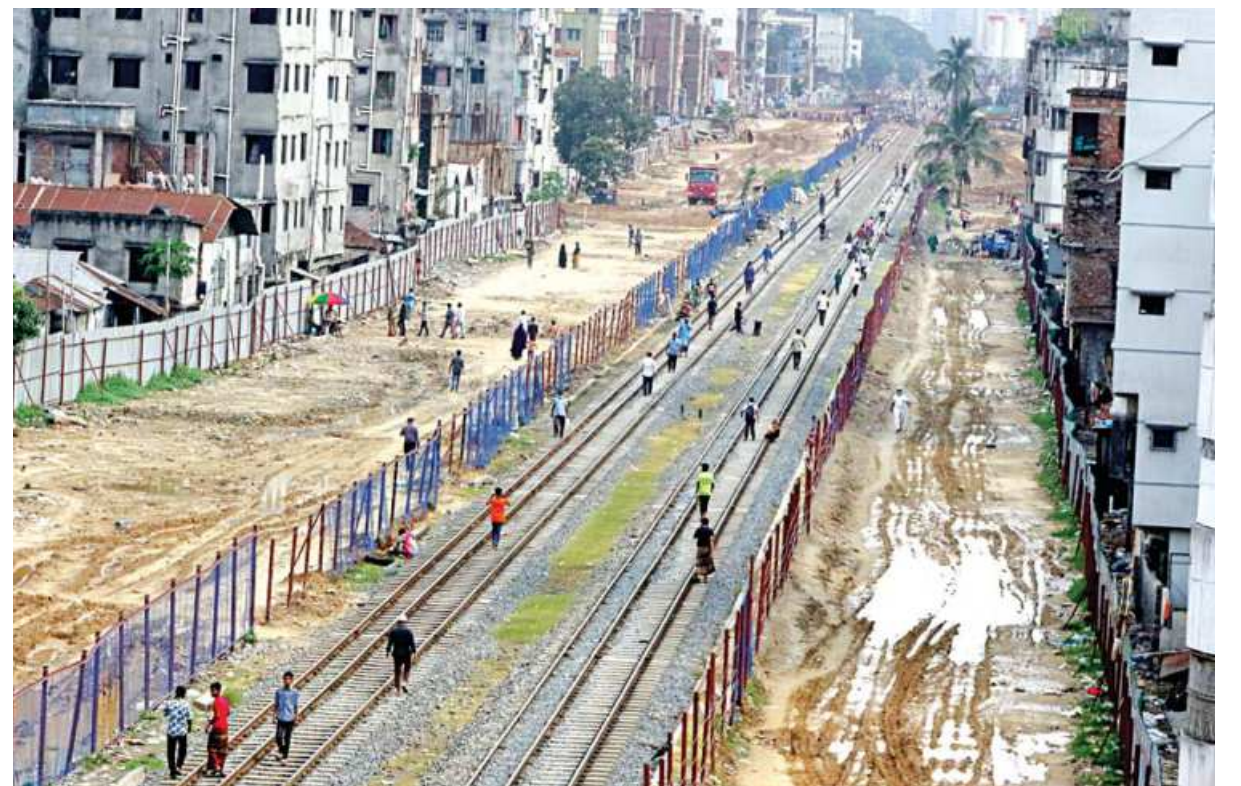
Illegal structures on both sides of a railway lines have been removed for constructing an elevated expressway from Hazrat Shahjalal International Airport to Kutubkhali on Dhaka-Chattogram highway. This photo was captured from the capital's Mohakhali rail crossing area yesterday.

SEE PAGE 10 COL 6 RELATED STORY ON PAGE 3