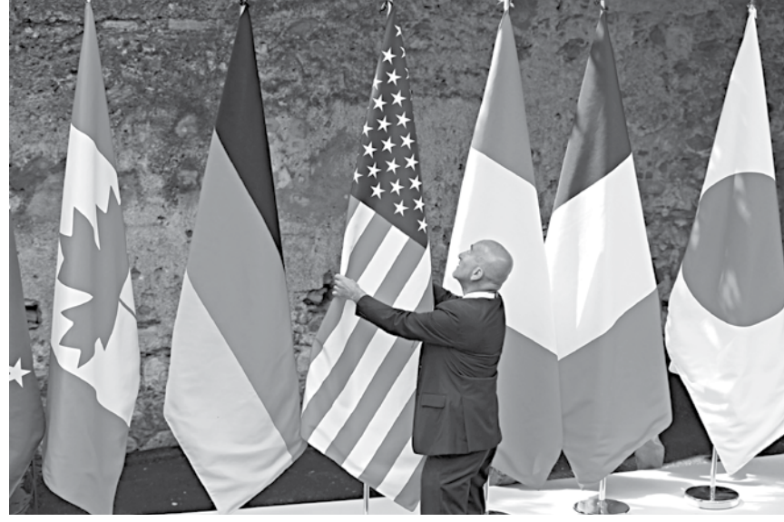
Climate advocates are anxiously looking forward to the tone of the three-day G7 summit which starts today in the scenic Carbis Bay, Cornwall, UK.