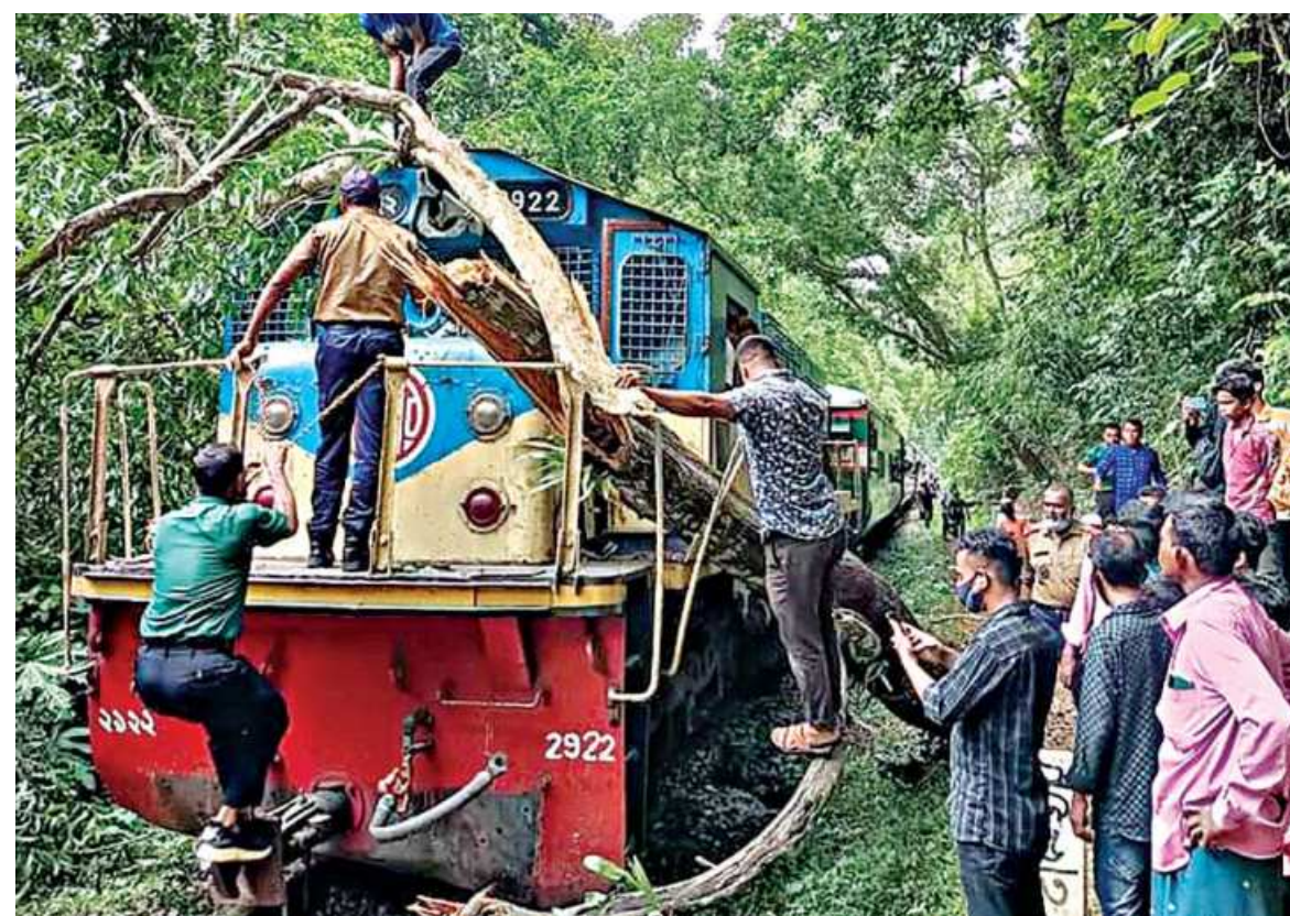
Police and railway employees remove a tree that fell on the locomotive of Parabat Express in Lawachhara of Moulvibazar around noon yesterday. The accident happened when the train was heading for Sylhet from Dhaka. This disrupted rail communication on the route for about an hour.