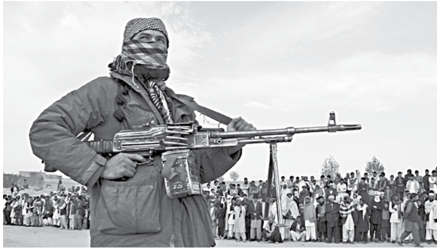
‘With the Taliban more powerful than ever and poised to reclaim power in Kabul, the only external victor will be the ISI.’