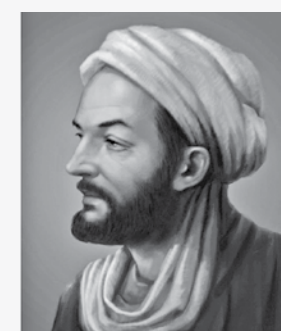
IBN SINA (980-1037) Persian physician

The more brilliant the lightning, the quicker it disappears.