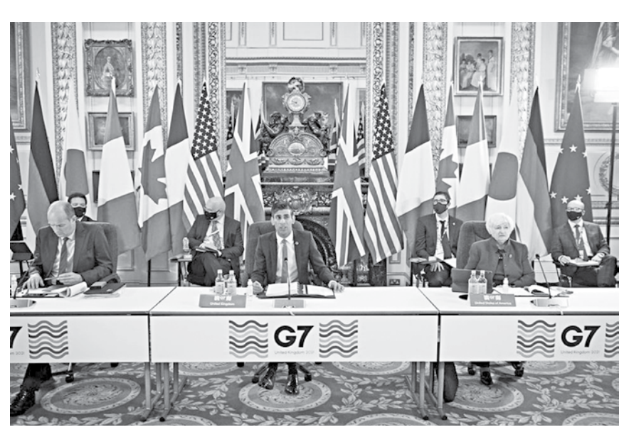
Britain's Chancellor of the Exchequer Rishi Sunak speaks at a meeting of finance ministers from across the G7 nations.

The next major event to look forward to is the meeting of the G7 presidents and prime ministers in the UK this weekend, which will be followed by a meeting of the leaders of G20 countries in Italy a month later. Now is the time for global leaders to become more effective at tackling global problems like the pandemic and climate change, where no single country, no matter how big or powerful, can hope to tackle the problem alone. In fact, often trying to protect one's own citizens while neglecting other countries can be counterproductive. This is clearly true for Covid-19 vaccinations—even if every single citizen in a developed country gets vaccinated, they remain at risk from new variants if citizens