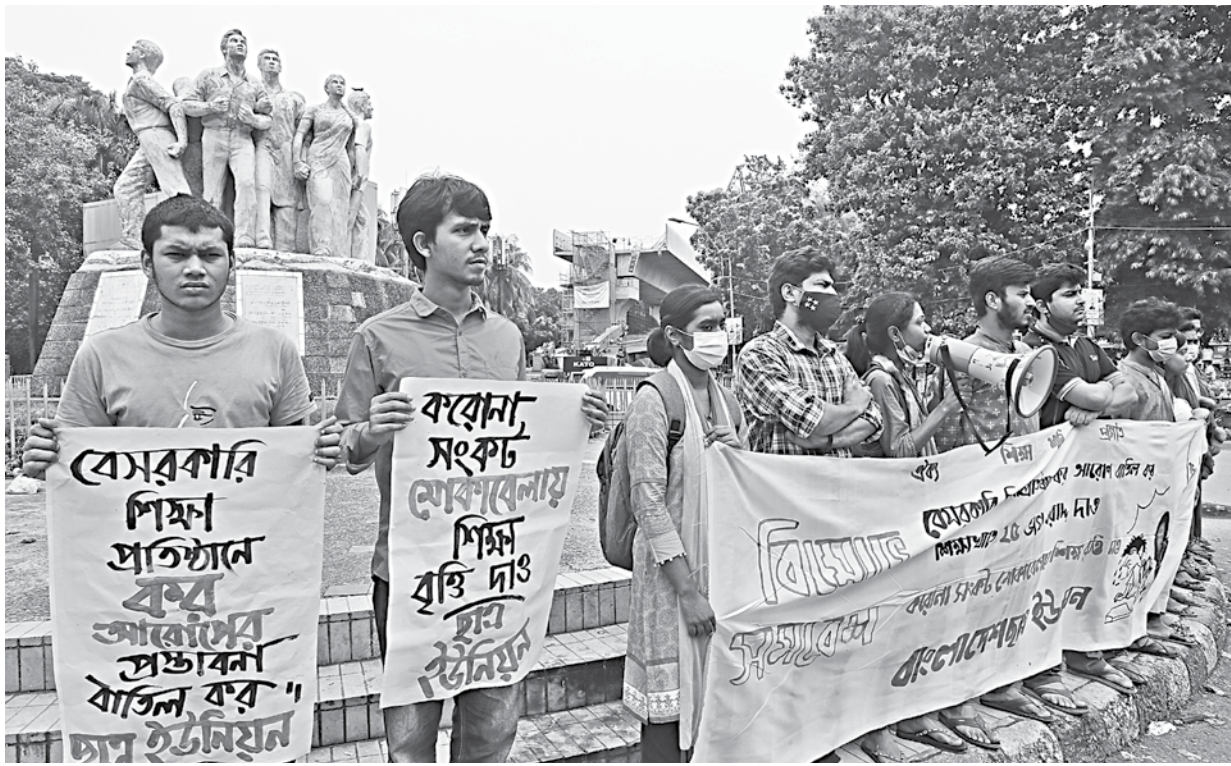
Bangladesh Chhatra Union activists yesterday formed a human chain in front of Raju Memorial sculpture on Dhaka University campus, demanding that the proposal to impose tax on private educational institutions be scrapped, and scholarships be given to students to overcome Covid-19 fallout.