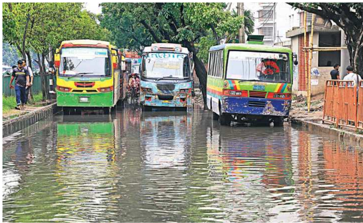
Buses on a waterlogged street near Azimpur Chowrasta in the capital after a brief spell of rain yesterday morning. This caused disruption in movement of traffic in the area for hours.

"While most of the funds for heavy industries have been disbursed, the pace was slow in disbursing those for agriculture, small and medium industries, and the low-income people," it mentioned.