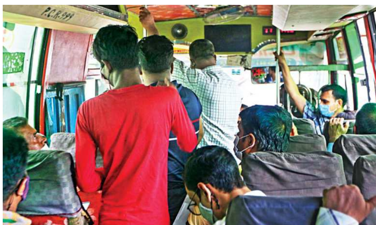
The inside of a bus in the capital's Paltan area shows that passengers are packed together, some having to stand as there are no seats available. This is in violation of the government directive on buses to operate at half capacity in order to maintain social distancing guidelines. While they are charging the 60 percent higher fares to compensate for reduced capacity, many operators are ignoring the half-capacity directive.