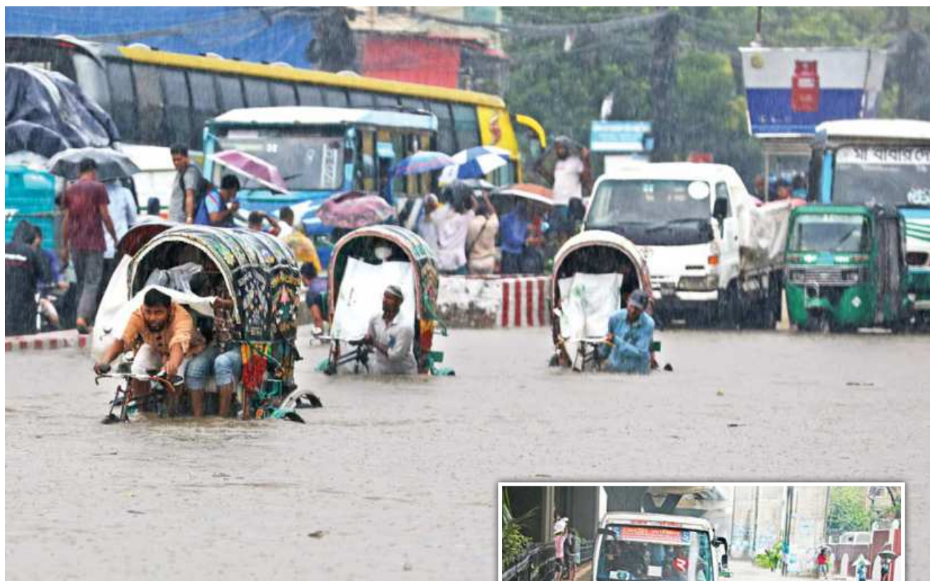
Rickshaw-pullers in Chattogram city's Muradpur area drag their vehicles in waist-deep water while behind them, other vehicles are poised on slightly higher ground, preparing to take the plunge. Inset, the lower third of a bus in the Gate No-2 area is submerged as parts of the port city saw severe waterlogging during incessant rainfall yesterday.