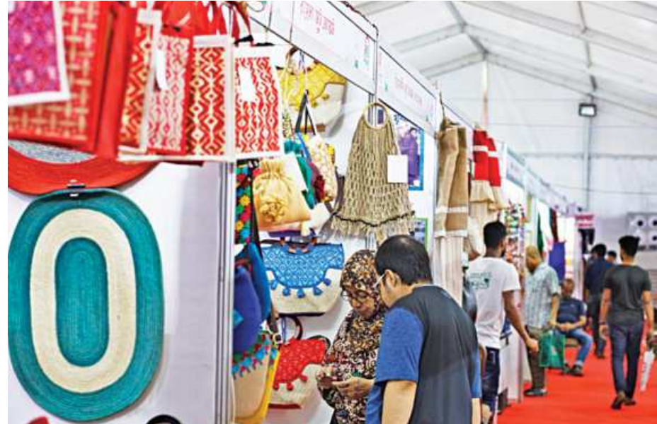
Industries Minister Nurul Majid Mahmud Humayun said small businesses were the worst affected by the pandemic.