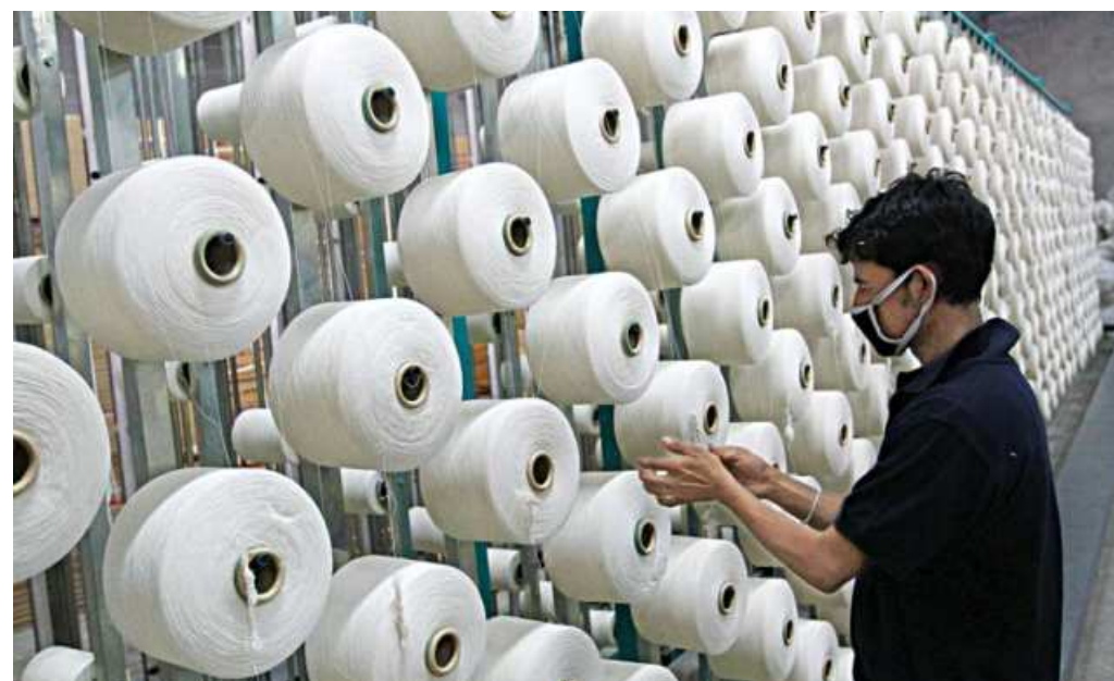
Of the total garment exports from Bangladesh in a year, 74 per cent are made from cotton fibre while the rest from manmade fibre.