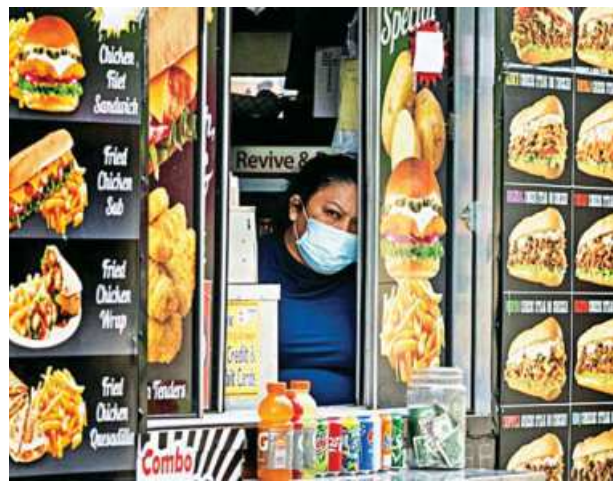
US businesses are hiring, but Labor Department data indicates some unemployed workers are staying away from the workplace, constraining employment growth.

"Since that period, an additional 21 million adult age Americans have gotten fully vaccinated, and so we're making progress even since this snapshot in time," Deese told reporters.