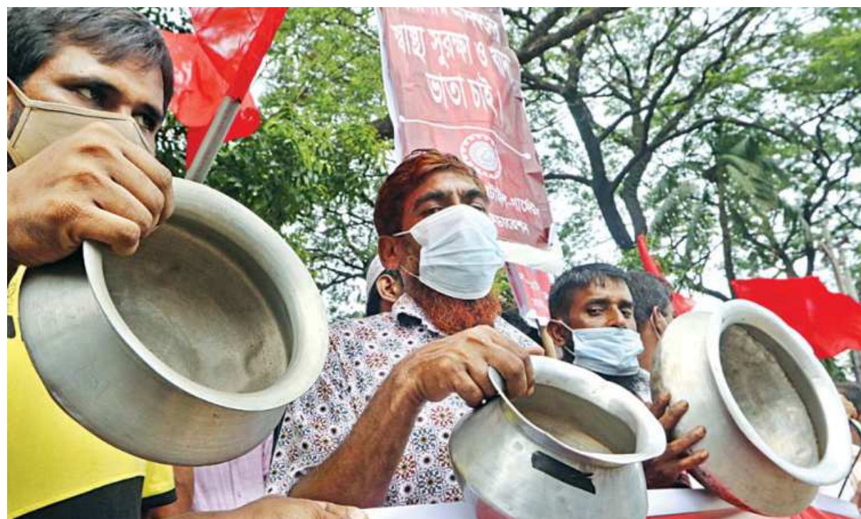
Terming the proposed budget “pro-rich”, two workers' groups -- Bangladesh Textile Garments Sramik Federation and Bangladesh Motorjan Mechanic Sramik Federation -- demonstrated in front of the Jatiya Press Club yesterday. Symbolising their impoverished state, they stood with empty cooking pots in hand, protesting the budget's overlooking of workers' interests.