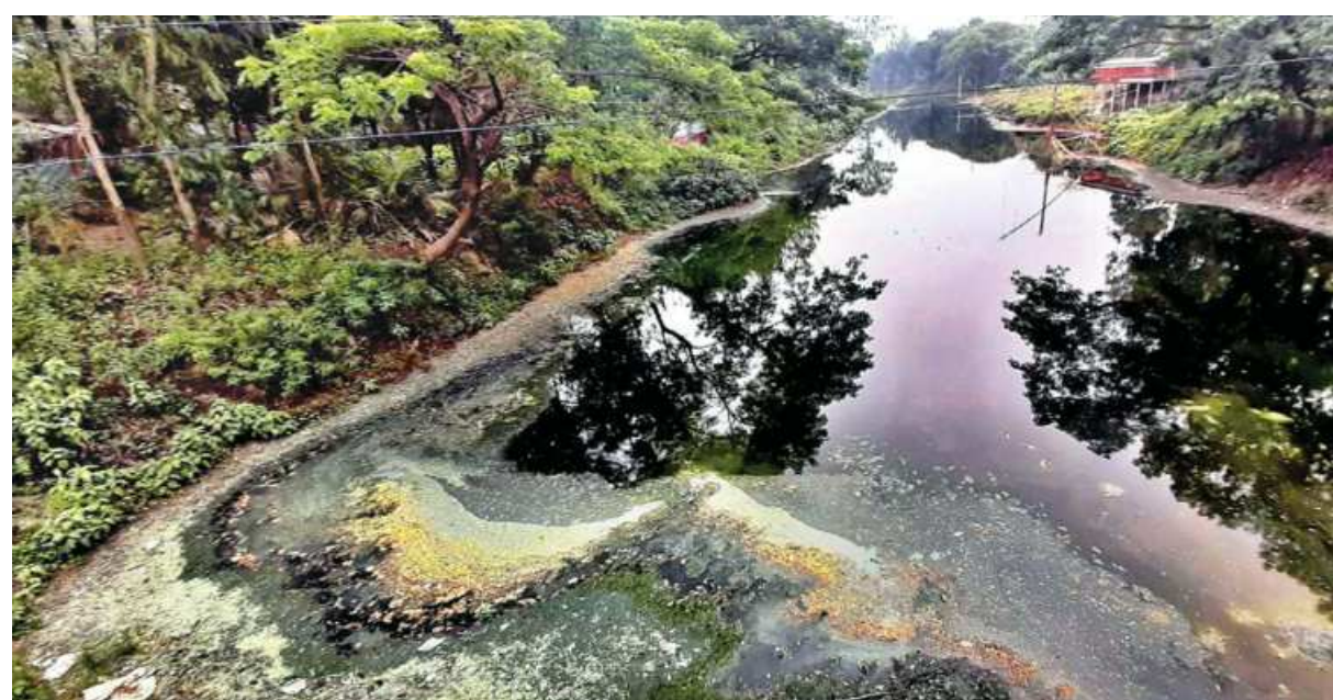
The Louhajang river in Tangail's Khudirampur area is badly polluted due to discharge of untreated waste into the water body by local factories. Many rivers in the district have become highly polluted over the years. This pollution is causing serious damage to the life and livelihood of the local people. The photo was taken recently.