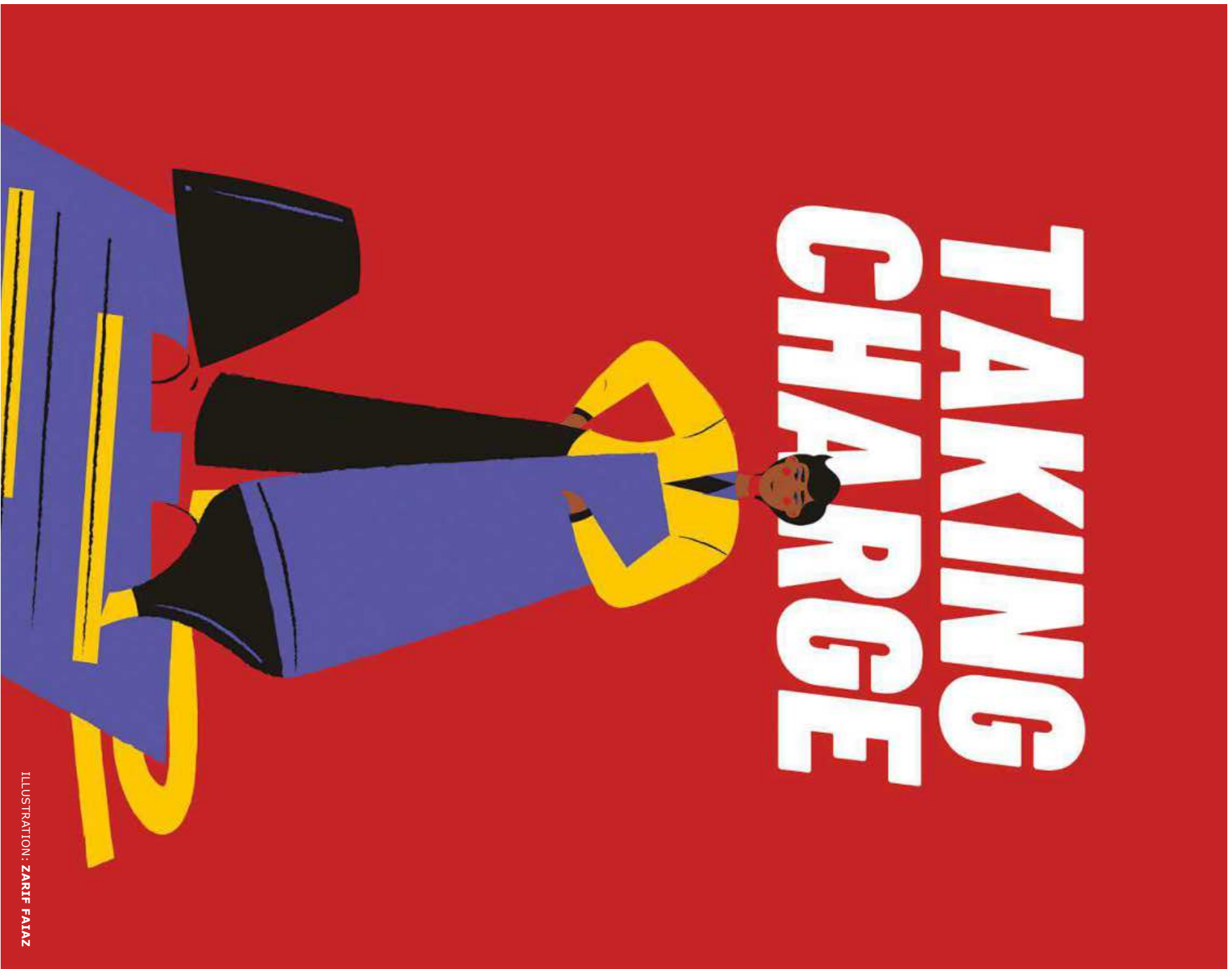
ILLUSTRATION: ZARIF FAIAZ