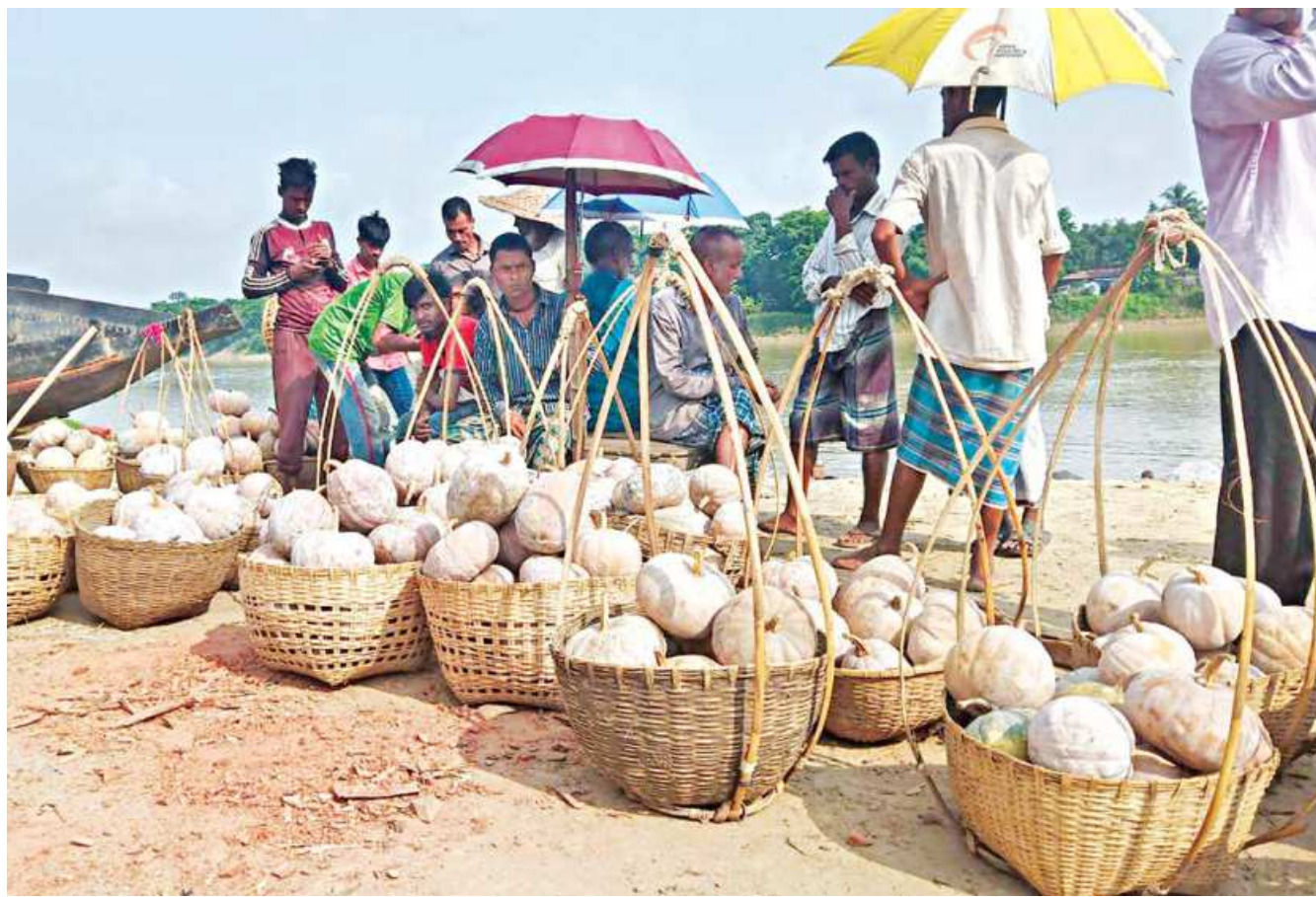
Farmers put their pumpkins on display for sale at Fenchuganj Paschimbaraz in Sylhet. Every 100 pumpkins wholesale at Tk 1,200-Tk 4,000, depending on their sizes. Over 2,000 people in the upazila are engaged in pumpkin farming. This photo was taken recently.