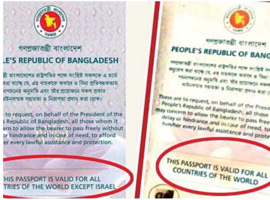
A collage of photos reflecting the recent change in Bangladeshi passport.

The changes to the passports are being brought in light of the DG of the Department of Immigration and Passports. What we demand to know is, how was the decision taken to effect the change? Was it a decision taken by the government at the highest level, by the cabinet? Apparently, the foreign ministry was not in the loop, if we are to believe the BBC report about the foreign ministry calling the home minister about the matter after it came to light, only to be told that the decision had been taken six months ago... so much for our decision-making mechanism. He and the nation came to know of it only after a tweet from an official in the Israeli foreign ministry (with a hopeful expectation from the Bangladesh government) came to our notice. If the matter is so innocuous,