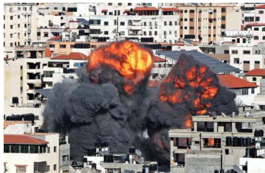
Smoke and flames rise during an Israeli air strike in Gaza City amid a flare-up of Israeli-Palestinian violence, on May 14, 2021.

The secret of Israel's strength is not hidden in its weaponry. Instead, this still-expanding and still-colonising apartheid settler state uses the same magic that enabled just a handful of 18th-century Englishmen to colonise the entire Indian subcontinent. Let's recall that in ruling over 200 million natives for 250 years, at no time did