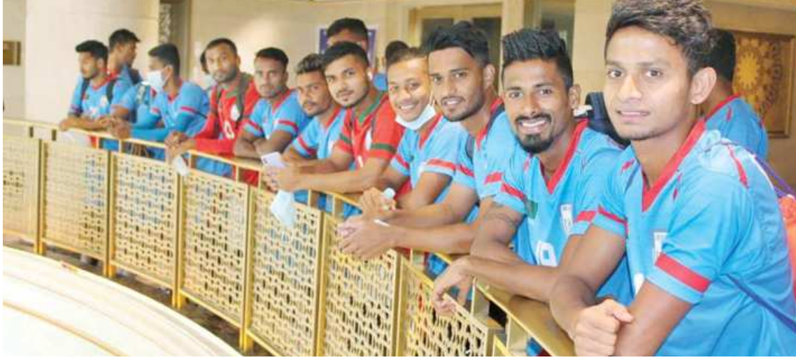
Bangladesh footballers appear in relaxed mood as they pose for a photograph at the team hotel in Doha yesterday ahead of today's World Cup qualifying fixture against Afghanistan.