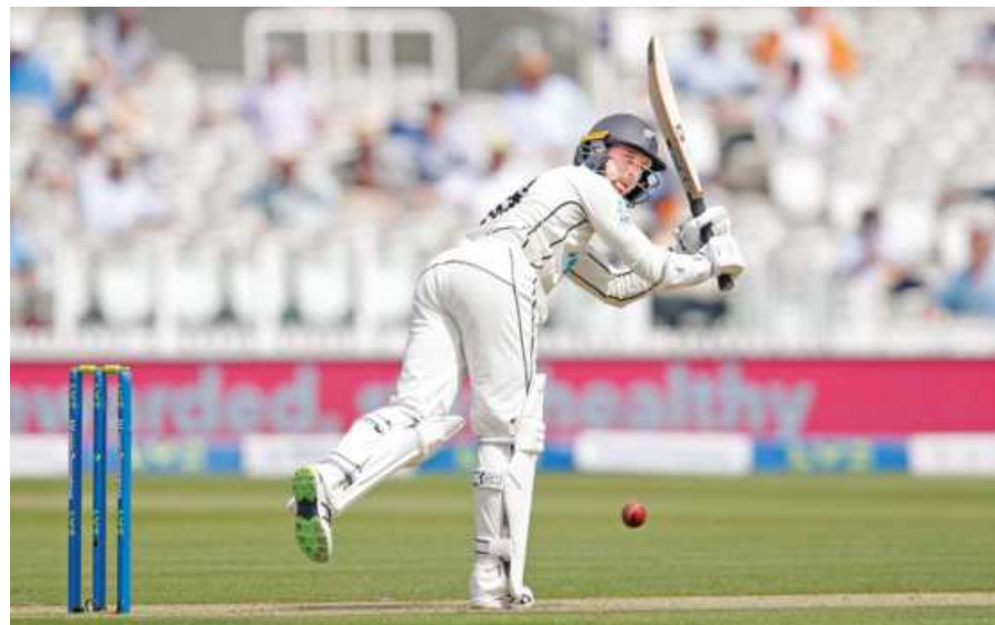
New Zealand batsman Devon Conway flicks one towards the square leg boundary during a sparkling hundred against England in the first Test at Lord's on Wednesday. The debutante was unbeaten on 112 as the visitors reached 194 for three in 62 overs after electing to bat.

Bangladesh have suffered defeat twice in seven matches against Afghanistan and have not beaten them in the past five matches since a 4-1 win in 1979.