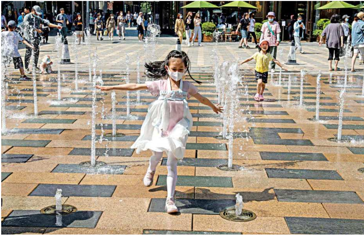
A girl runs through a fountain outside a shopping mall on International Children's Day in Beijing, yesterday. China's decision to allow families to have up to three children was met with scepticism yesterday, with doubts expressed on social media whether it would make much difference, and calls for details on what promised "supportive measures" will include. On Monday, Beijing announced the new plan on Monday, weeks after census data confirmed rapid aging and a decline in fertility that puts China on track to see its population, the world's largest, begin shrinking.

"Forcing a popular news talk show host like Hamid Mir off the air after voicing criticism of Pakistan's military, and support for a fellow journalist, only underscores the lack of true