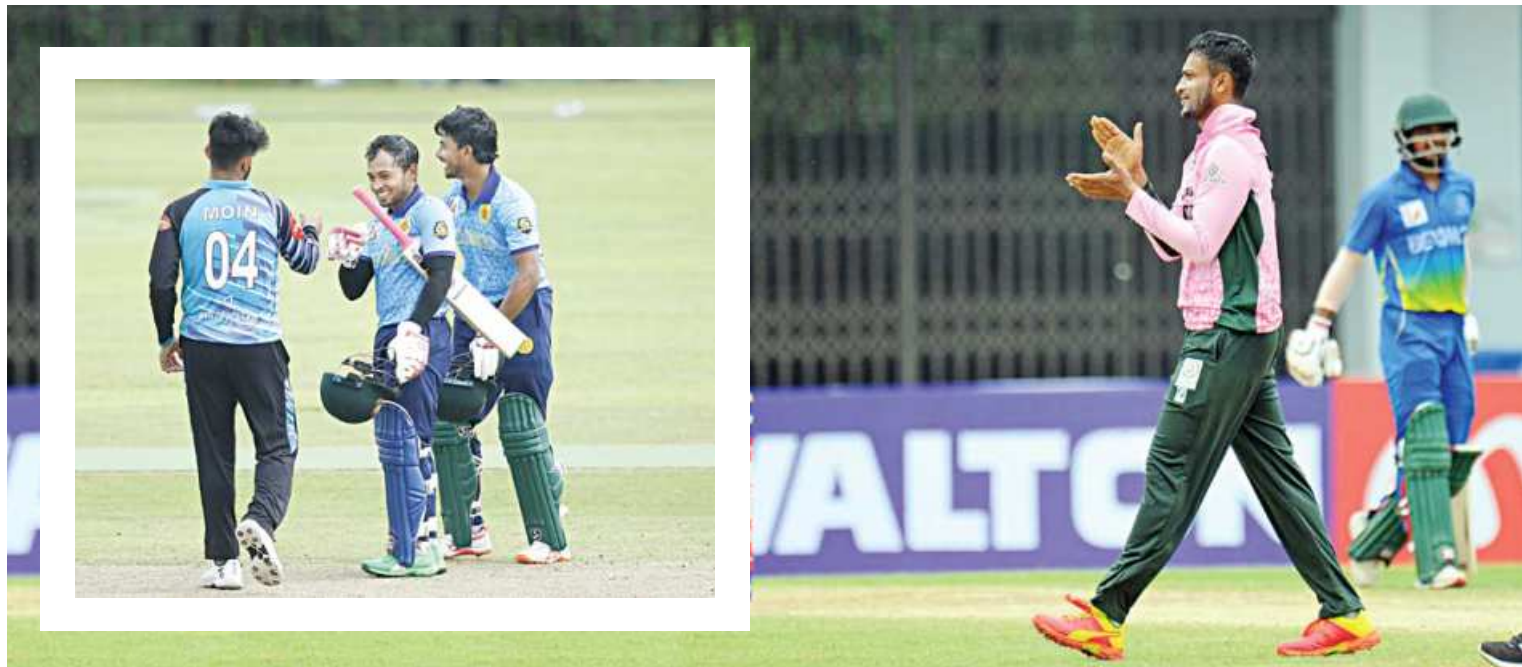
Skipper Mushfiqur Rahim (inset) is all smiles after guiding Abahani to a seven-wicket victory over Partex Sporting Club at the Sher-e-Bangla National Stadium in Mirpur while Mohammedan captain Shakib Al Hasan celebrates a scalp during their game against Shinepukur Cricket Club at BKSP on the opening day of the Bangabandhu Dhaka Premier Division T20 League yesterday.