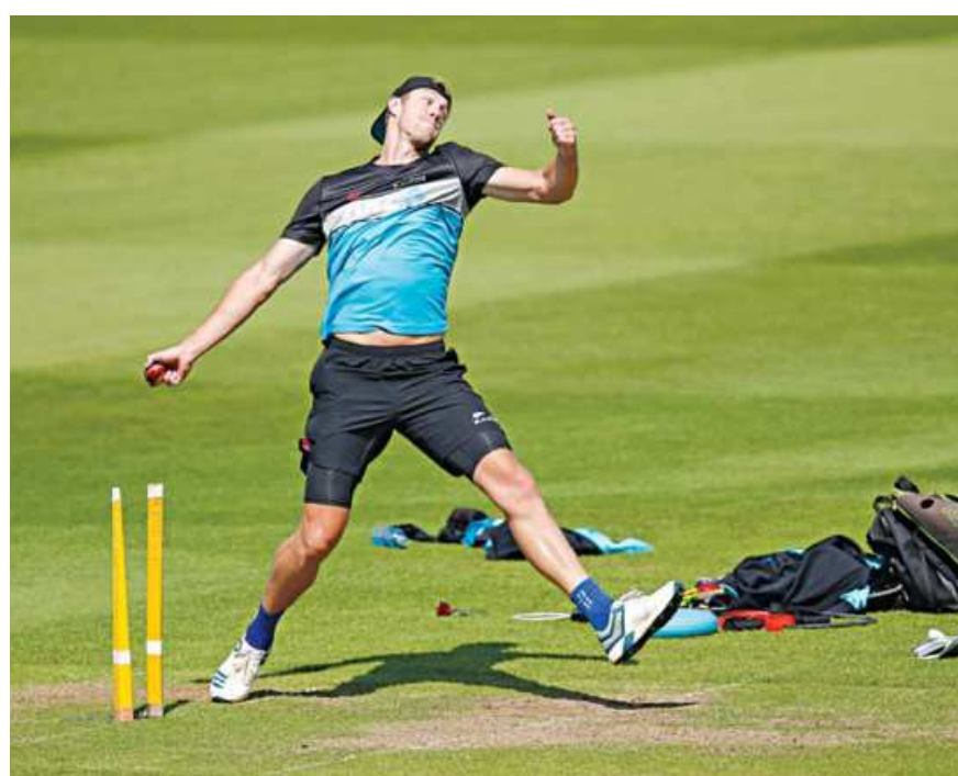
New Zealand pace sensation Kyle Jamieson bowls during a practice session yesterday ahead of the first Test against England, starting from tomorrow at Lord's. For New Zealand, it looks like the ideal preparation for the World Test Championship final against India this month. The Kiwis will look to make the most of these two games to acclimatise to the conditions and get their team combination right.

It was the first time that the 13-time European champions had failed to win a trophy in 11 seasons. It is the second time that Zidane has resigned as Real Madrid manager.