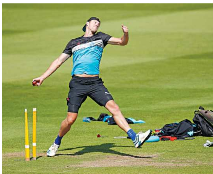
New Zealand pace sensation Kyle Jamieson bowls during a practice session yesterday ahead of the first Test against England, starting from tomorrow at Lord's. For New Zealand, it looks like the ideal preparation for the World Test Championship final against India this month. The Kiwis will look to make the most of these two games to acclimatise to the conditions and get their team combination right.

It was the first time that the 13-time European champions had failed to win a trophy in 11 seasons. It is the second time that Zidane has resigned as Real Madrid manager.