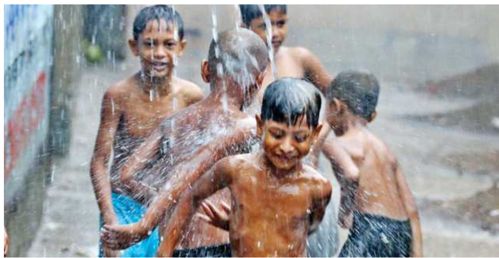
Children frolic in the rain that brought the temperature down after sweltering heat yesterday. The photo was taken in Wireless area of the capital's Moghbazar.