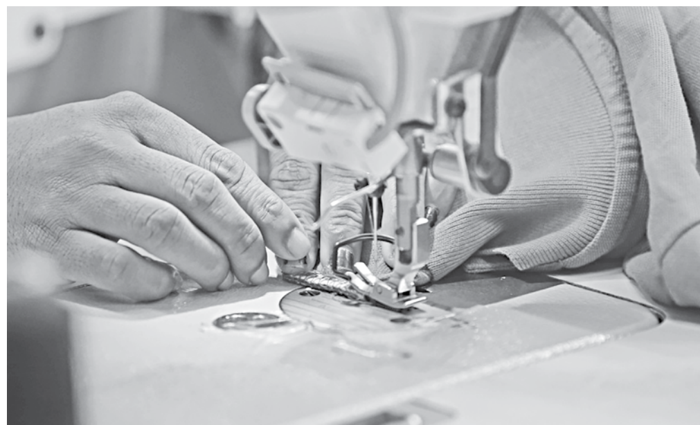
The current safety arrangement under which our garment factories are being inspected is the RMG Sustainability Council.

The way external forces—the Accord and Alliance—supported us to transform the