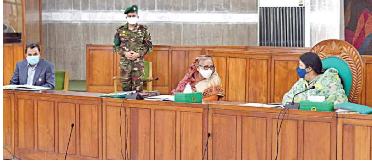
Prime Minister Sheikh Hasina speaking to Speaker Shirin Sharmin Chaudhury at the 32nd Parliament Secretariat Commission meeting held at the Jatiya Sangsad yesterday.

[The article was originally published in Indian news portal The Print on May 28] https://theprint.in/diplomacy/covid-aid-to-india-financial-help-to-sri-lanka-bangladesh-is-showcasing-its-economic-rise/667019/