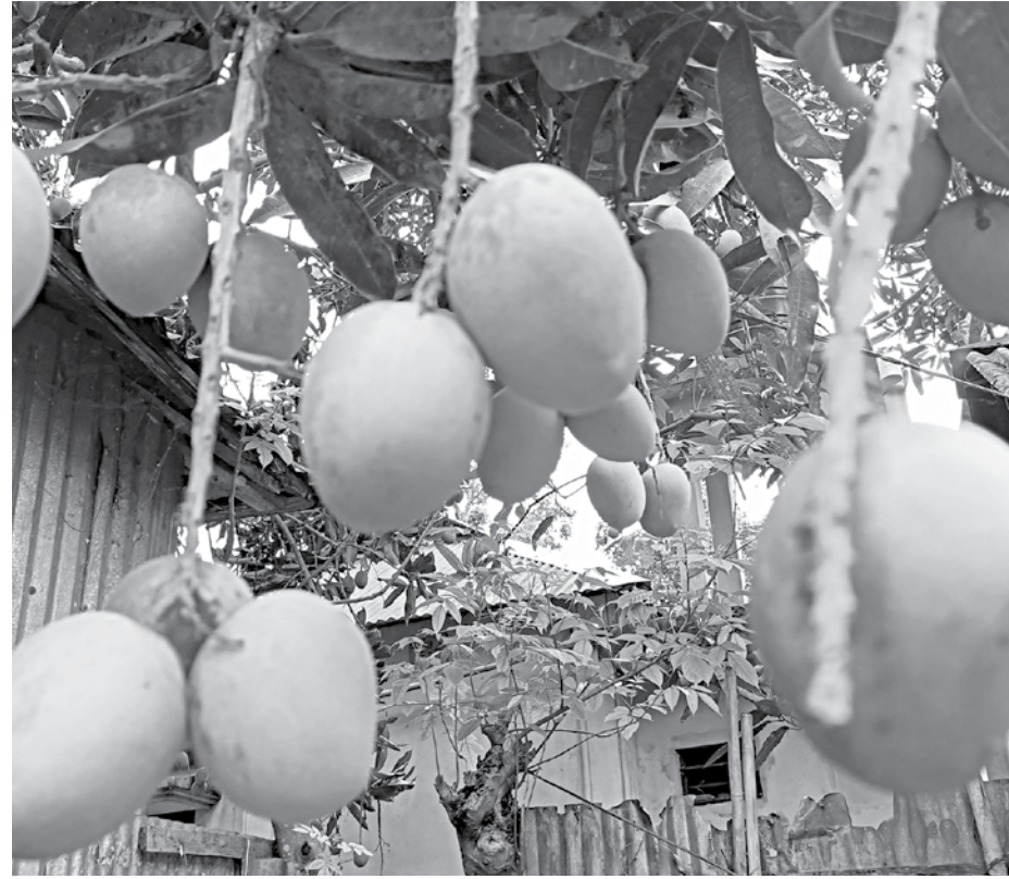
A mango tree in a farmer's homestead at Harishwar Taluk village in Kurigram's Rajarhat upazila.