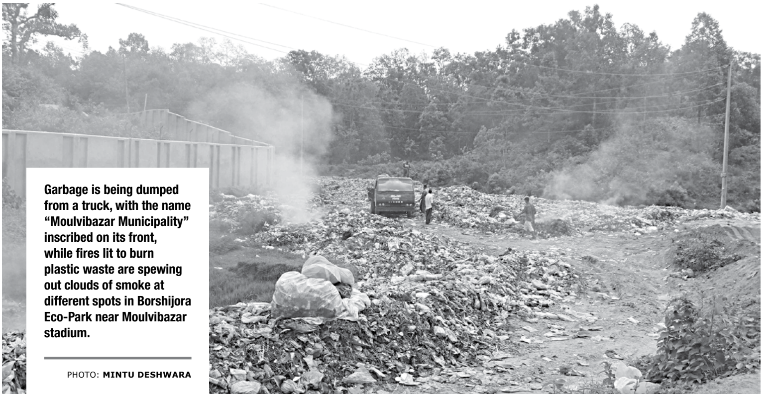
Garbage is being dumped from a truck, with the name "Moulvibazar Municipality" inscribed on its front, while fires lit to burn plastic waste are spewing out clouds of smoke at different spots in Borshijora Eco-Park near Moulvibazar stadium.