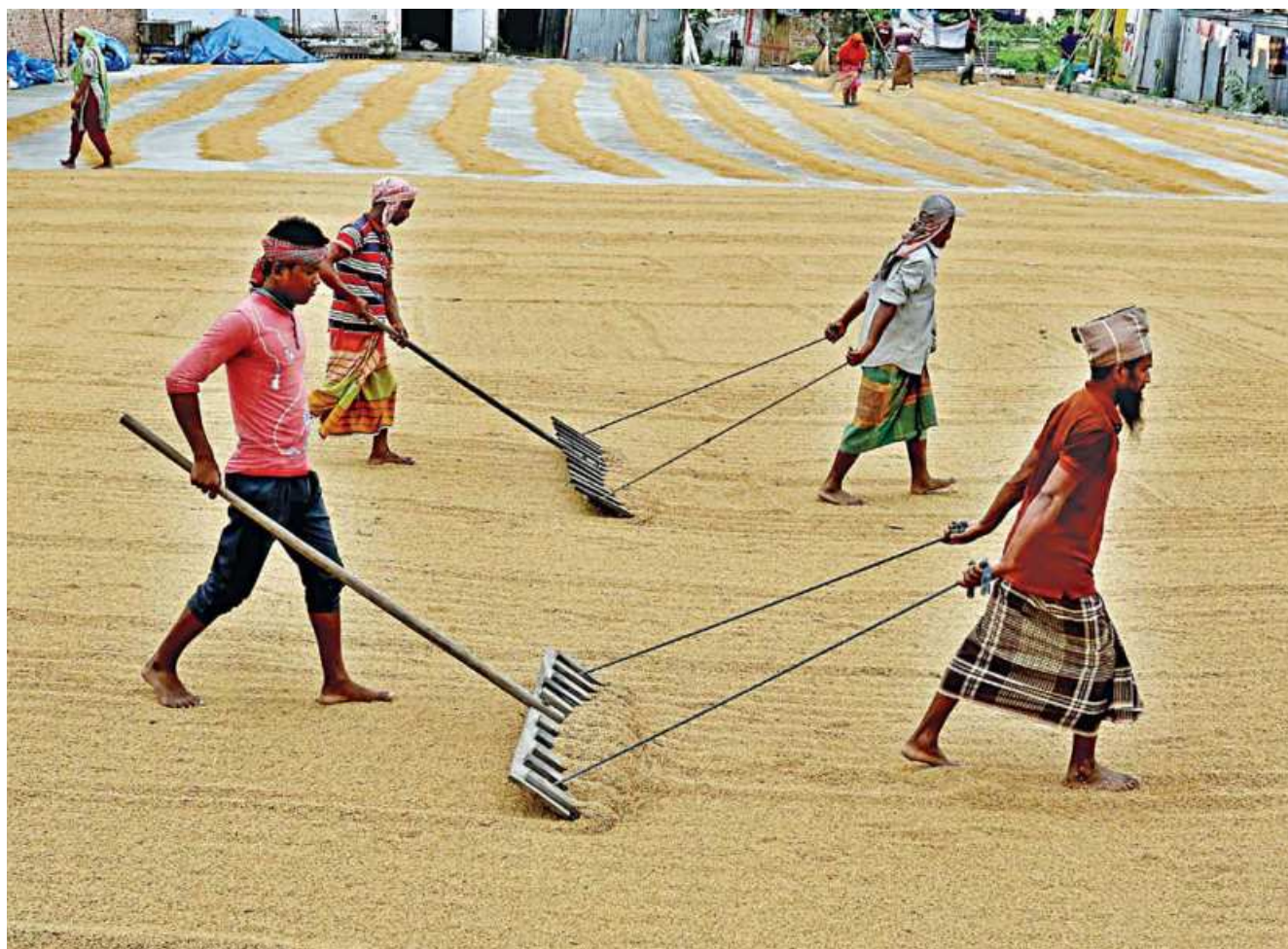
Farmers drying paddy on the concrete floor at a mill in Nimtoli area of Munshiganj before the husk and the bran layers are removed to produce the country's staple food, rice. Officials said the growers have been blessed with a remarkable harvest this year.