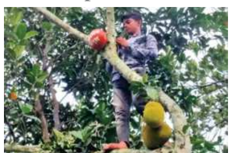
PHOTO: COLLECTED A youth sets up a clay pot on a tree where birds can build nests with ease.

"Birds of many species used to live in this area. But indiscriminate felling of trees and spread of human habitat and infrastructure has greatly harmed the biodiversity of this beautiful village," said forum member