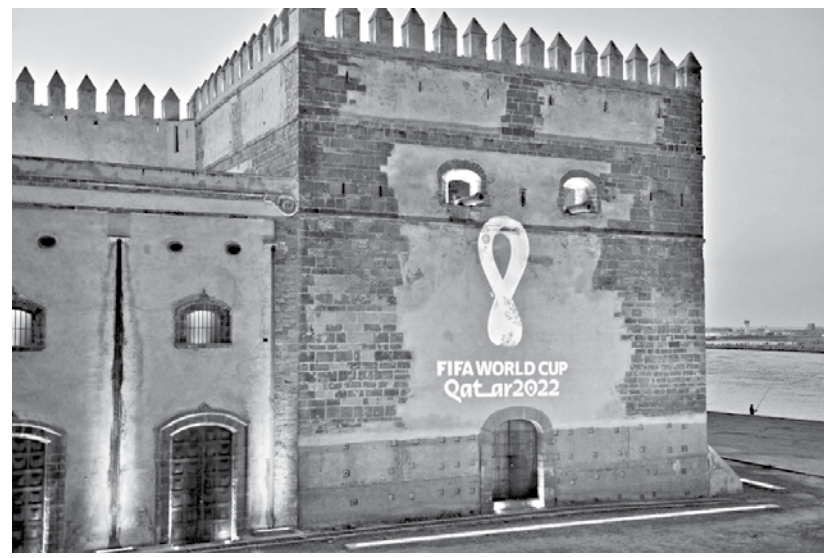
The official 2022 Fifa World Cup Qatar logo is projected on the walls of the Oudaya kasbah in the Moroccan capital Rabat.

is buildings, airports, highways or stadiums. Simply put, sustainability engulfs three aspects: ecology, economy and environment. Sustainability is badly needed to avert the worst impacts of climate change. On the other hand, innovation can make something better or effective. FIFA World Cup Qatar 2022 illustrates best how a sports event can be refurbished with innovation and sustainability and thereby making the event effective to negate the externalities of climate change.