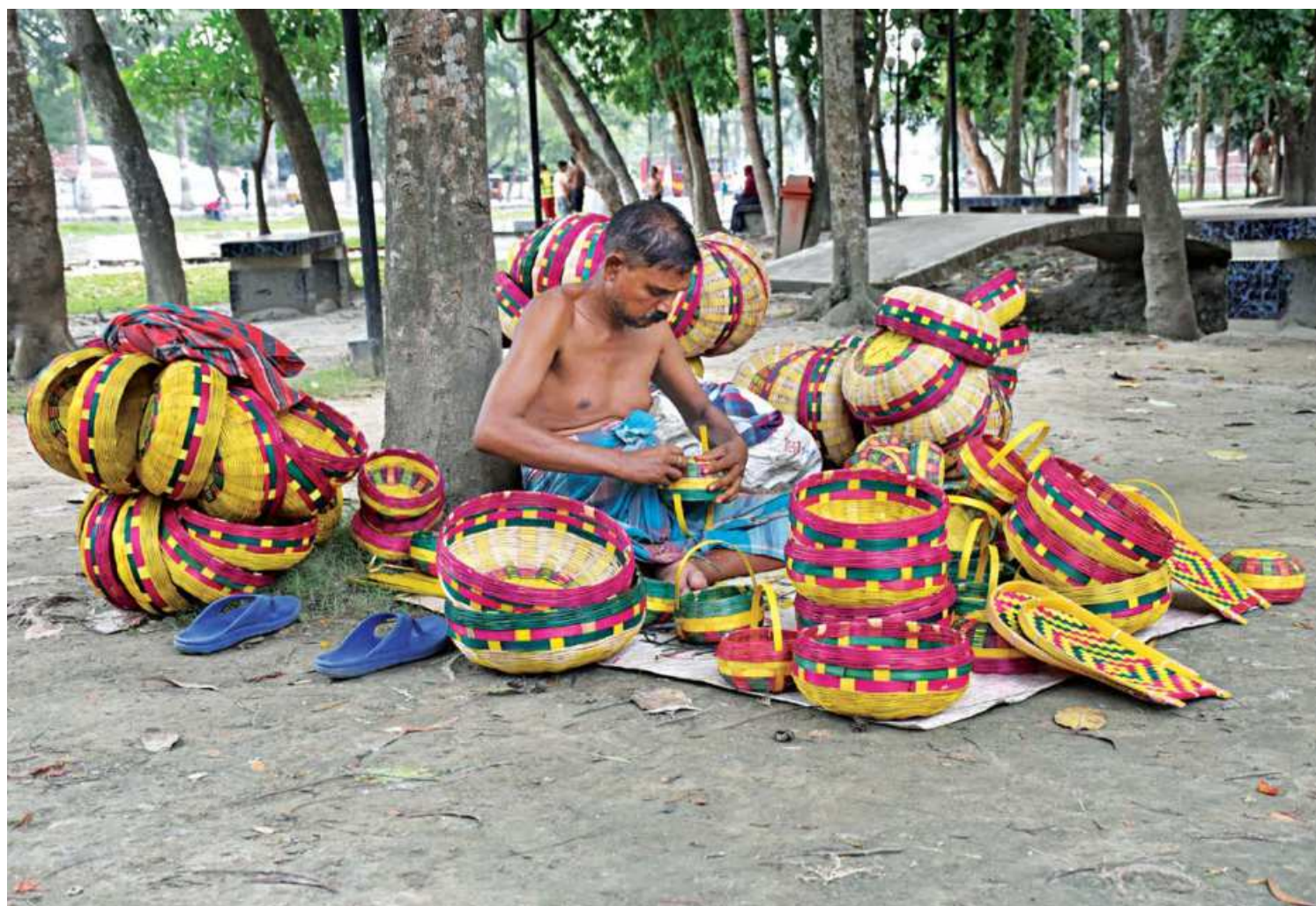
A craftsman in South Alekanda of Barishal weaving baskets to be used for keeping food items. He goes from one place to another to sell the baskets and earns around Tk 1,200 a day, of which around Tk 300 is his net profit. The photo was taken yesterday.