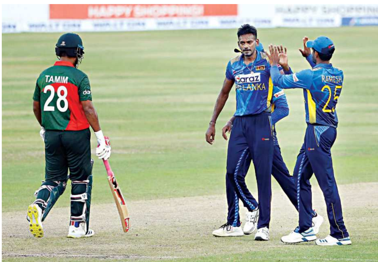
Sri Lanka pacer Dushmantha Chameera (C) celebrates dismissing Bangladesh captain Tamim Iqbal -- one of his five wickets -- during the third ODI at the Sher-e-Bangla National Stadium in Mirpur yesterday. The youngster's efforts helped bowl Bangladesh out for 189 for a 97-run victory for the visitors, who had earlier scored 286 courtesy of a 120-run knock from Kusal Perera.