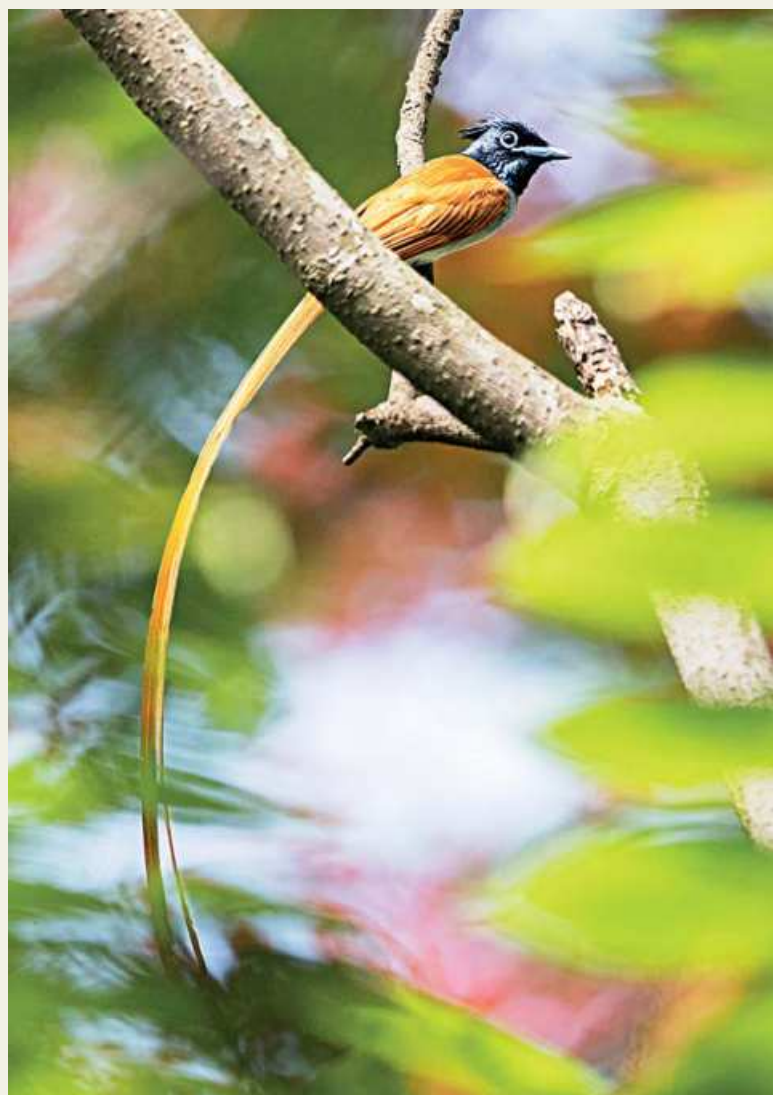
Asian Paradise Flycatcher, Narayanganj, Bangladesh.

Taking in a sharp breath and forgetting to exhale is a common reaction when watching a flying male Asian Paradise Flycatcher. That's because, like an apparition straight out of the Arabian Nights, two long tail streamers several times the length of the bird glide behind it making waves in the sky. I've seen many beautiful birds around the world and this bird ranks high among them.