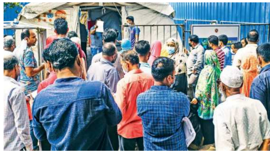
People waiting to get tested for coronavirus in front of a tent on the premises of Shaheed Suhrawardy Medical College and Hospital, on March 15, 2021.

The B.1.617.2 variant has two significant mutations on its Spike