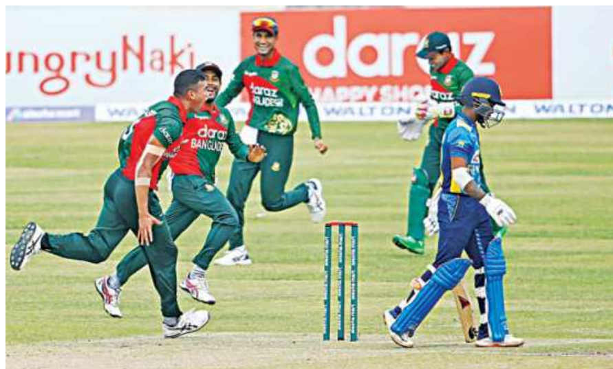
Bangladesh pacer Taskin Ahmed celebrates after taking the wicket of Pathum Nissanka during the third and final ODI against Sri Lanka in Mirpur yesterday.

It was an ideal game for Taskin, who bowled in various situations and once again made an impact in the death overs. He picked up his fourth wicket in the 49th over of the innings to end with figures of four for 46 from nine overs.