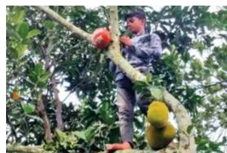
A youth sets up a clay pot on a tree where birds can build nests with ease.

"Birds of many species used to live in this area. But indiscriminate felling of trees and spread of human habitat and infrastructure has greatly harmed the biodiversity of this beautiful village," said forum member