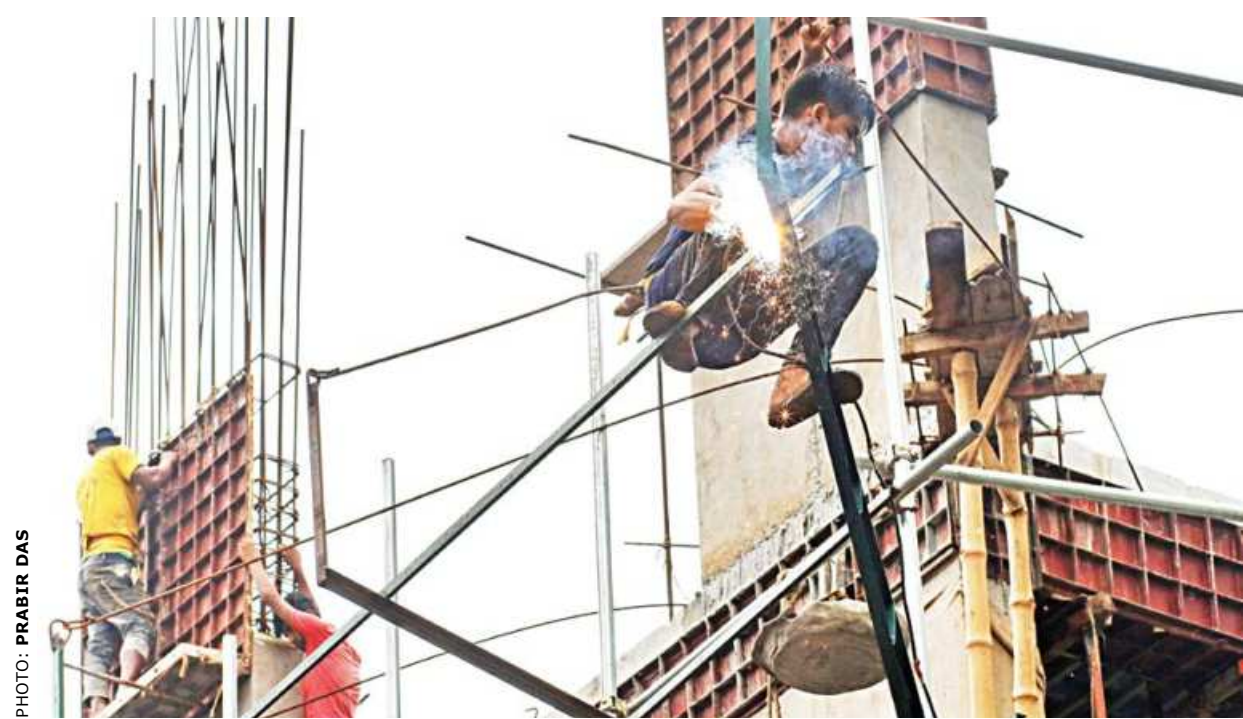
A worker barely balances himself on two thin rods, welding a safety shed on the fifth level of an under-construction building to prevent any debris from falling on passers-by. But there is no safety equipment, or even a helmet for the worker himself as he risks his life at the site. This photo was taken from Kazi Nazrul Islam Avenue in Dhaka recently.