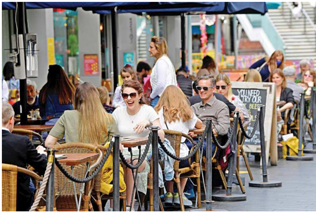
People relax at outdoor dining areas on the South Bank, as lockdown restrictions continue to ease amidst the spread of the Covid-19 pandemic, in London, Britain, yesterday. Despite a robust Covid vaccination campaign, the estimated reproduction "R" number in England has likely crept over 1 and the epidemic could be growing by as much as 3 percent each day, Britain's health ministry said.

While not suggesting that a lab leak was necessarily the source, a number of prominent international scientists have said a deeper, more scientific look at the theory was needed.