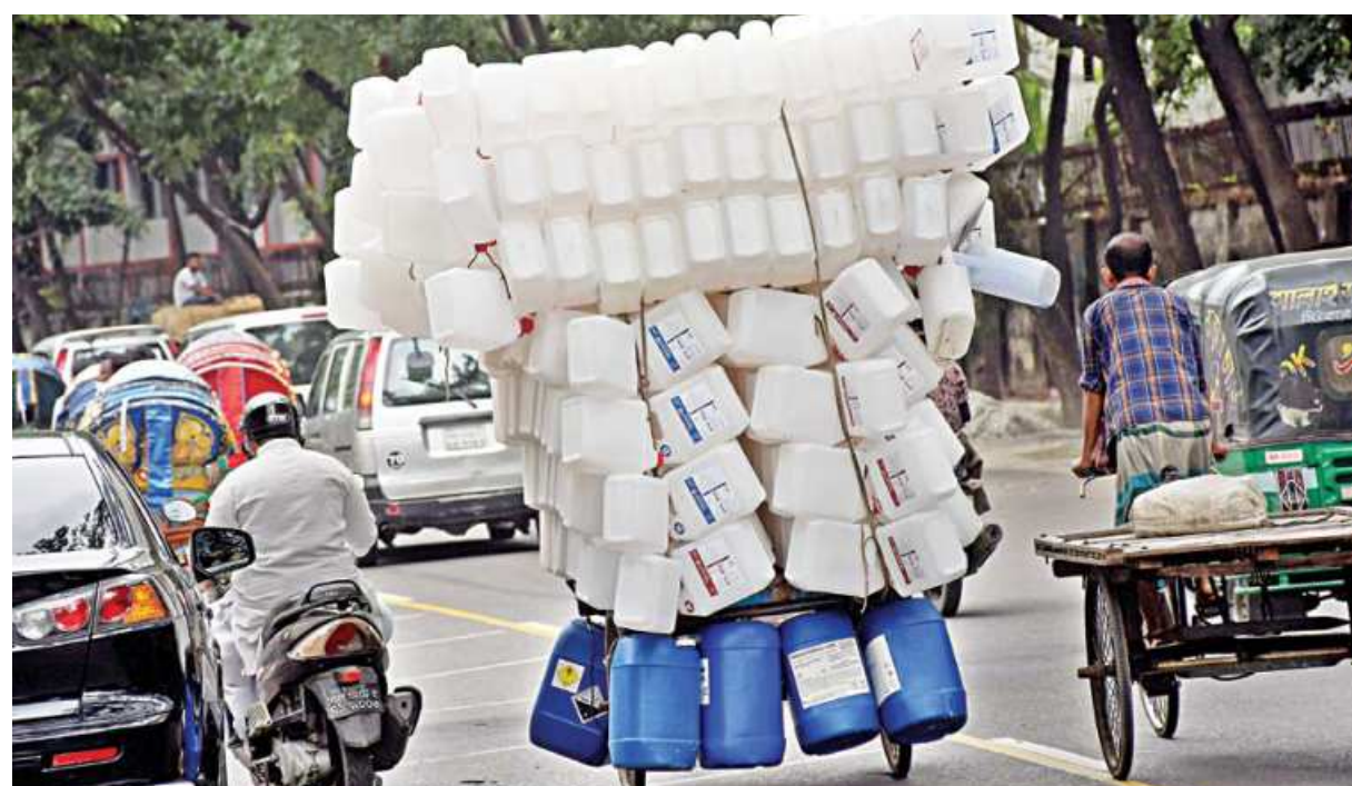
A rickshaw-van driver is on his way to deliver a mountain of empty plastic containers, neatly stacked and fastened with rope on the three-wheeler. The stack is so high that the driver can't be even seen from the back. While such seemingly precarious arrangements is the norm for transporting materials on rickshaw-vans, sometimes they may be too risky for the roads. This photo was taken on Thursday from the capital's Palashi intersection.