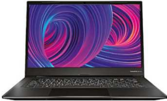
Walton Tamarind EX10 Pro

With PC parts prices skyrocketing due to production falling short of demand as people are investing more in home offices during the Covid-19 pandemic, more and more people choose a prebuilt system such as the laptop.