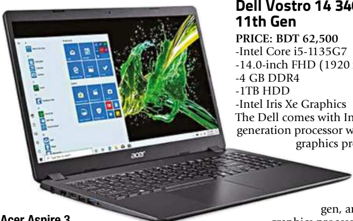
Acer Aspire 3 A315-57G

PRICE: BDT 56,990 -Intel Core i5-1035G1 -15.6" Full HD 1920 x 1080 LCD -8GB DDR4 RAM -1 TB HDD -Intel UHD Graphics