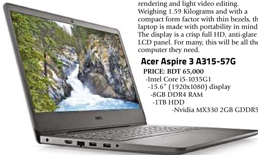
Dell Vostro 14 3400 Core i5 11th Gen

This laptop is a bang for the buck because of its tremendous upgradability and low price. The laptop is great as is, but throw in another ram stick and an NVMe SSD and you have got yourself a powerhouse. On top of that, it comes with 8 GB of dual-channel RAM installed from the factory which will hugely increase your RAM bandwidth. Intel's 10th gen processor coupled with UHD graphics can also handle some photo and video editing and light gaming. At 1.9 kilograms, it is not heavy either. It is a seriously good deal, and anybody would be happy with the performance it delivers.