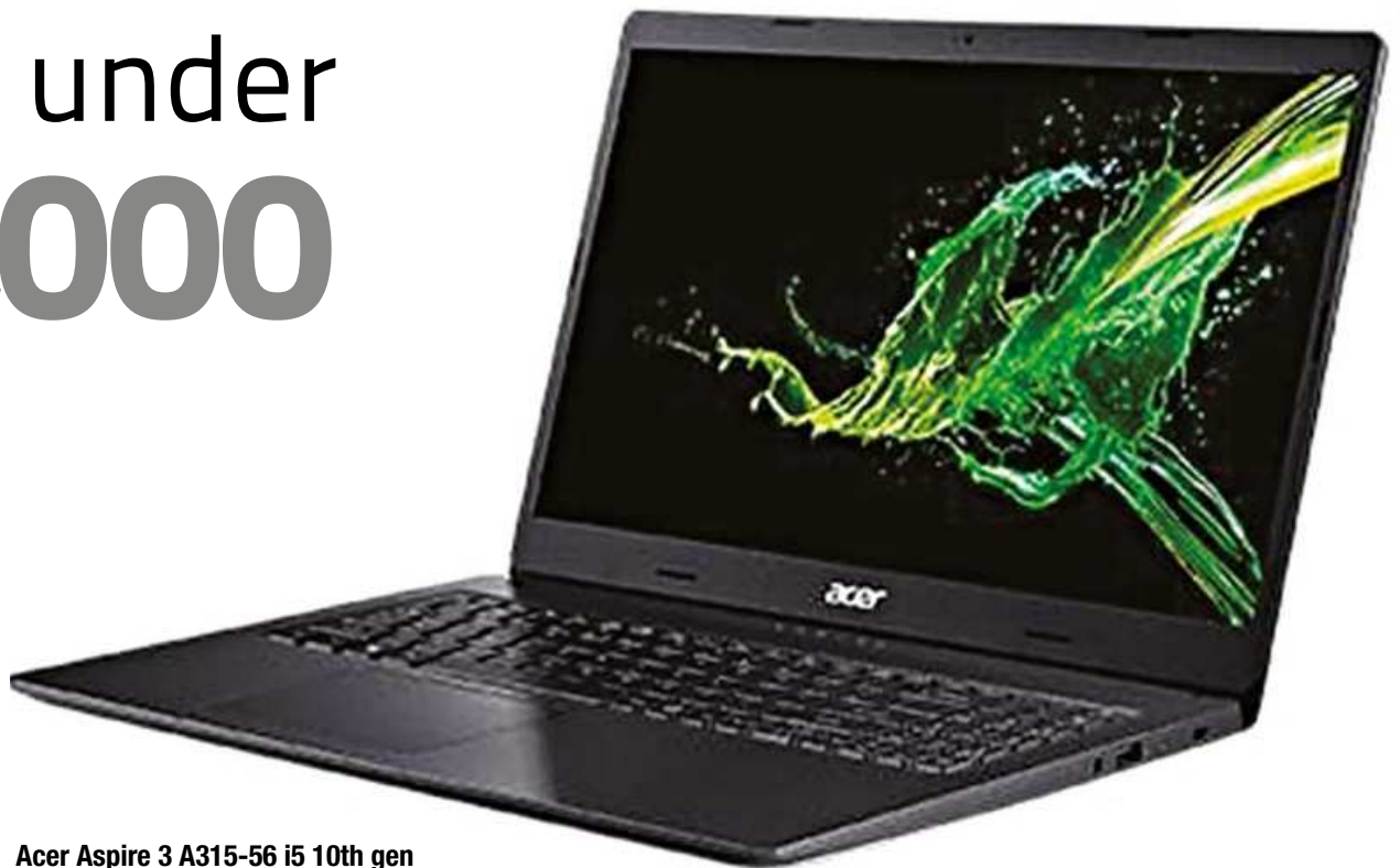
Acer Aspire 3 A315-56 i5 10th gen