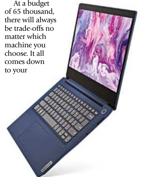
Lenovo Ideapad Slim 3i i5 10th Ge

At a budget of 65 thousand, there will always be trade-offs no matter which machine you choose. It all comes down to your