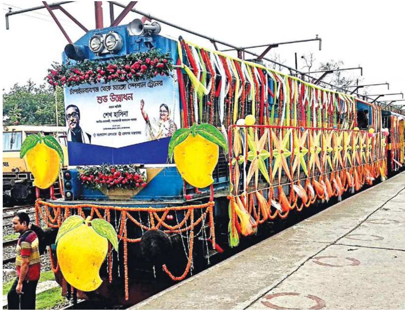
The decked-out "special mango train" with flowers and ribbons at Chapainawabganj Railway Station yesterday. Prime Minister Sheikh Hasina via video conference inaugurated the special freight train to cheaply transport mangoes to the capital via Rajshahi for the welfare of mango farmers and traders amid the Covid-19 situation.