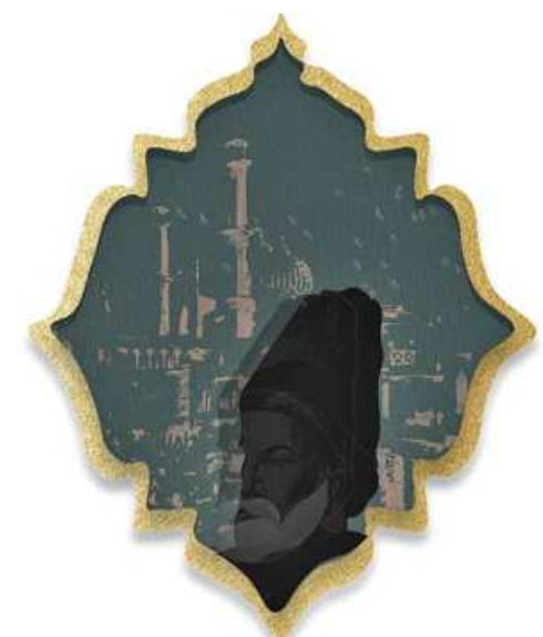
ILLUSTRATION: ZAREEN TASNIM BUSHRA

Words: An Introduction to Urdu Poetry (Penguin, 2014), Raza Mir's detour to fiction here is marked with sharp attention to detail, especially when he describes the food, clothing, architecture, ammunition, and science in the world of the novel. Dum biryani, kebabs, parathas and quail-stuffed goats mount the tables inside a shining haveli, abundant, yet "miraculously soft on the eye", and the prose soon absorbs the reader into a Delhi humming under the 19th century rule of emperors, landlords, and colonial powers; a Delhi in which newsprint is as valuable