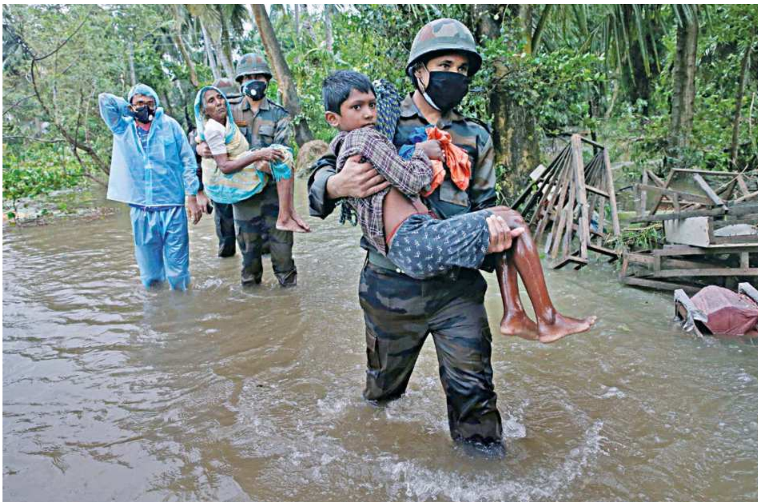
Army soldiers evacuate people from a flooded area to safer places as Cyclone Yaas makes landfall at Ramnagar in Purba Medinipur district in the eastern state of West Bengal, India, yesterday. At least two people died yesterday as howling winds and waves the height of double-decker buses belted eastern India in the Covid-stricken country's second cyclone in as many weeks.

Facebook has said it agrees with most of the provisions but is still looking to negotiate some aspects.