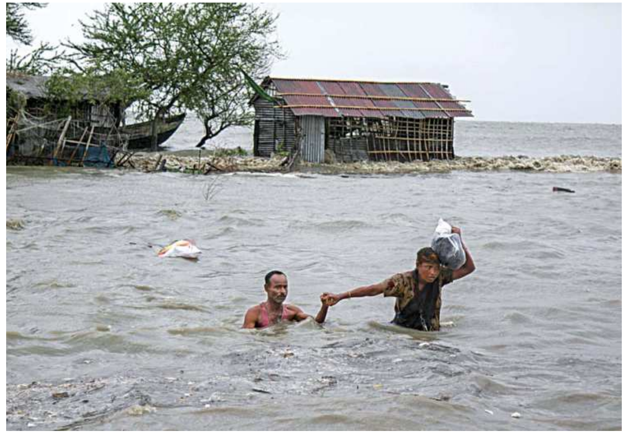
A woman helps a man out of his flooded shack while carrying a few of her belongings as high tide flowing inland wash away properties on the low lying areas of Chattogram due to cyclone Yaas. The photo was taken at Anandabazar yesterday.