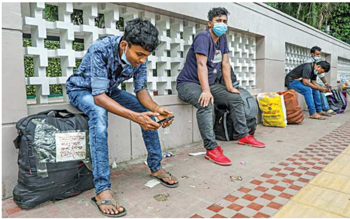
Puzzled migrant workers on the footpath outside Sonargaon hotel in the capital as Saudi Arabian Airlines officials said they will no longer book hotels in Saudi Arabia for the workers who are required to stay quarantine in hotels for seven days on reaching the gulf country.