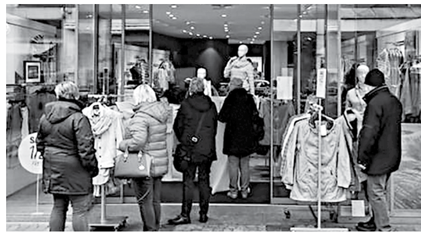
Hopes that Europe's largest economy will soon rebound after a damaging third wave of the pandemic were reflected in a surge in business confidence in May.

GDP shrank by five percent in 2020, its worst contraction since the financial crisis of 2009, due to economic fallout from the pandemic.