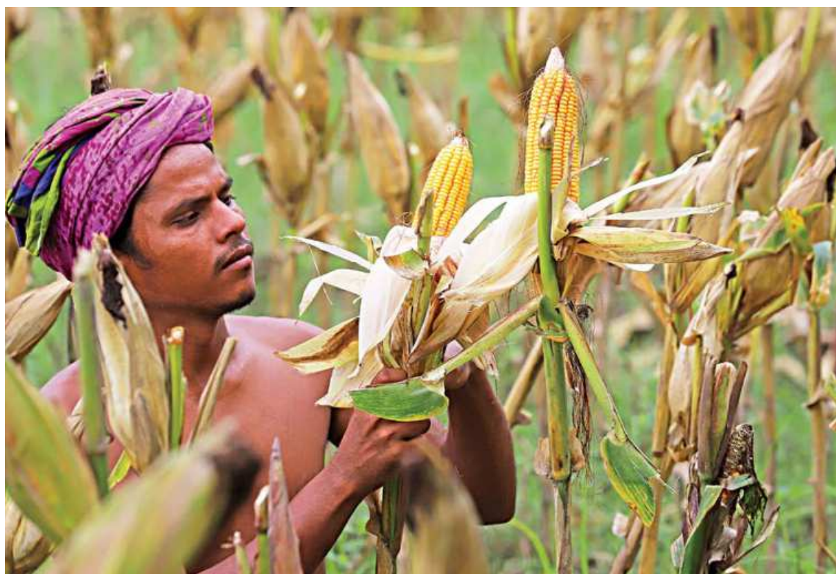
Farmers are becoming more inclined towards cultivating maize for its higher yields compared to traditional crops alongside better profits for high demand as it is the main component for producing poultry and fish feed apart from being consumed by people. The photo was taken recently at Char Bokshia in Ghatail of Tangail.