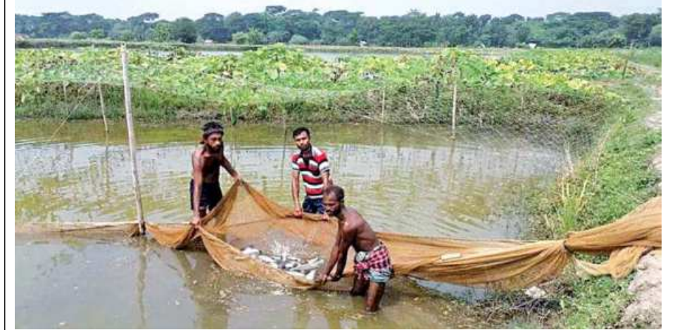
Over the past two decades, Bangladesh saw a massive expansion of aquaculture to meet increasing demand for fish.