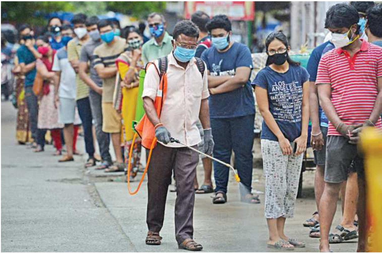
A health worker sanitizes as people wait to get themselves inoculated with the dose of Covishield coronavirus vaccine at a vaccination camp in a residential area in Chennai, India yesterday.