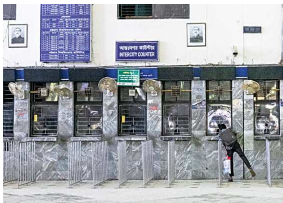
A man peeps into a ticket counter of the almost empty Chattogram Railway Station yesterday to see if tickets were being sold. Rumours started spreading in the port city yesterday that the government would allow inter-district public transport that had been suspended to curb the spread of coronavirus. The restrictions were partially lifted yesterday. Story on page 1