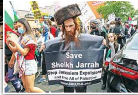
Palestinians sit in a makeshift tent amid the rubble of their houses which were destroyed by Israeli air strikes during the Israel-Hamas fighting in Gaza, yesterday. Inset, A anti-Zionist Jewish man carries a poster as people attend a protest in support of Palestine in Queens in New York on Saturday.