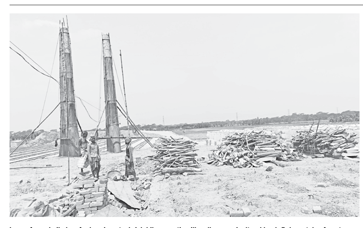
Logs of wood piled up for burning at a brick kiln operating illegally on agricultural land. Below, stolen forest wood being sized up at a saw mill set up at the same establishment -- Five Star brick kiln in Khakdan village of Barguna's Amtali upazila. The photos were taken recently.