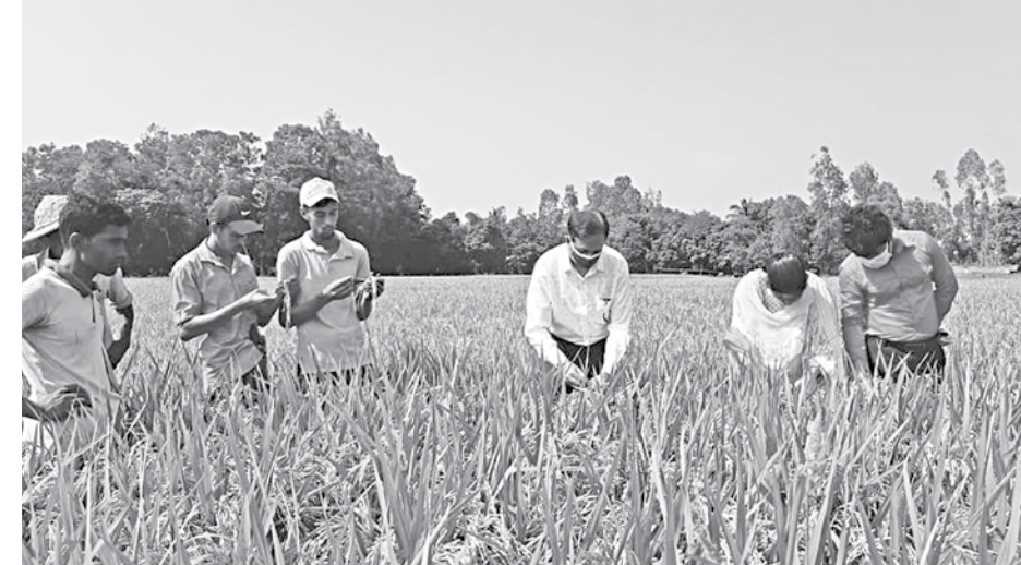
Officials of District Agriculture Extension Department officials visit a paddy filed at Meen Nagar village under Srimangal upazila of Moulvibazar.

Hybrid seeds were distributed free of cost to 26,800 farmers this year to encourage increased production during the Corona period. He said that the yield has been very