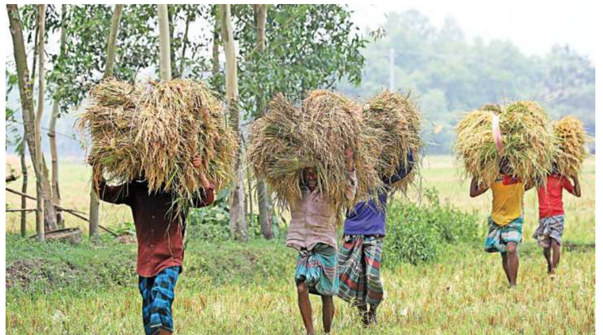
The government is encouraging farmers to harvest their Boro crops as fast as possible because of an impending cyclonic storm. The photo was taken recently from Ghatail upazila of Tangail.