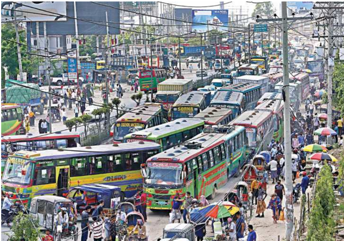
Buses taking a U-turn at Amin Bazar, Savar, causing a nearly two-kilometre tailback on Dhaka-Aricha highway, after they had dropped off passengers in the scorching heat. The passengers would have to walk or get other transport to the capital. After spending the Eid holidays at their hometowns, scores of people have been coming back to the city, often flouting health guidelines.